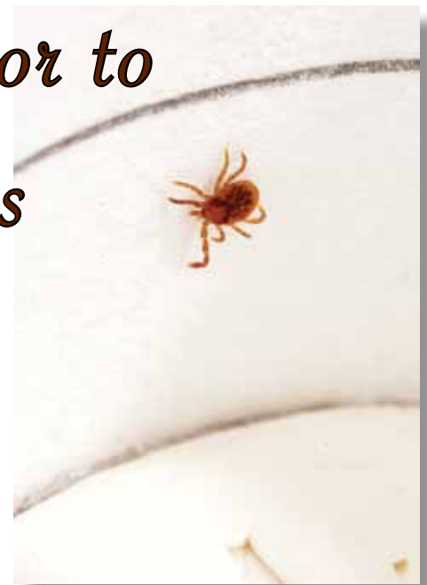
In a lab test, this lone star tick nymph ( Amblyomma americanum ) was exposed to a citrus rind chemical, placed upside down inside an untreated filter paper cylinder, and observed to see whether it could right itself.

Mosquitoes, ticks, and other blood-feeding arthropods are attracted to certain chemicals, such as carbon dioxide in an animal’s breath. One behavior of host-seeking ticks when a host draws near is to climb up a plant to reach the passing host and then find an attachment site on the host’s body.