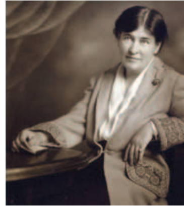
Willa Cather embroidered wool jacket, 1922