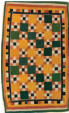
Quilts Ralli, Sindh, Pakistan, c 1974 (far right) Kantha, c 1940-1960, (right)