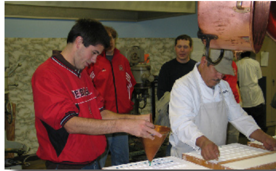
Food Science Club in action