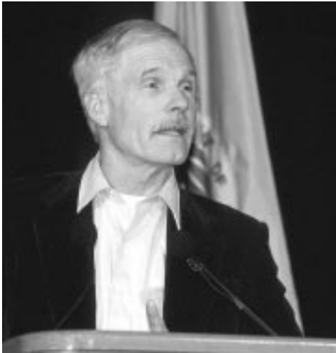
Advocate for wildlife. “Wildlife is first, second and third,” said Ted Turner.

Media tycoon Ted Turner advised delegates to the National Wildlife Refuge System Conference in Keystone, Colorado, to “work hard and put the pedal to the metal. If we don’t have a healthy environment, we don’t have a healthy human race.”