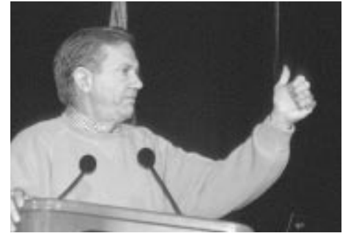
Friend in high places. Secretary Bruce Babbitt pledged to allow no more roads through refuges.

“As long as I am Secretary of the Interior,” Bruce Babbitt told delegates to the Keystone conference, “I will use every resource available to insure that no road is built through Izembek [National Wildlife Refuge].”