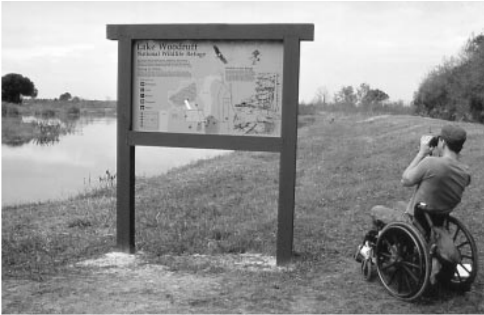
Lake Woodruff National Wildlife Refuge.

“What a grand event it was! I don’t think I’ve ever been in a group of more than 800 people where literally everyone was eager to meet everyone else. In particular, I was struck by just how proud each person was to say where they came from. From the Kenai Peninsula to the Everglades, every refuge manager showed a distinct pride in telling his or her story. On top of that, interesting speakers recharged many batteries. A special thanks for the invitation!”