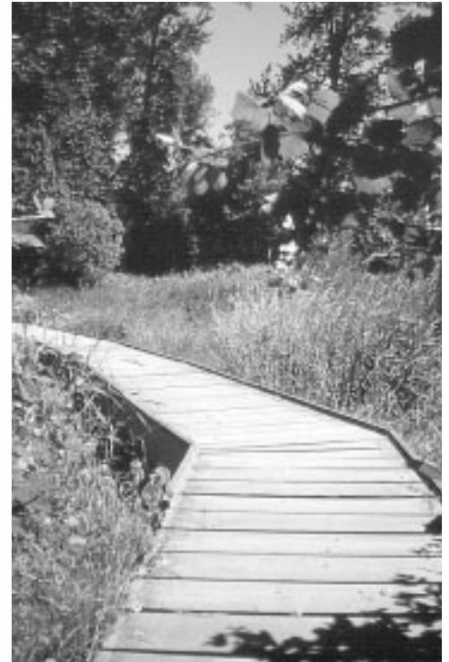
Nisqually NWR, Washington State.