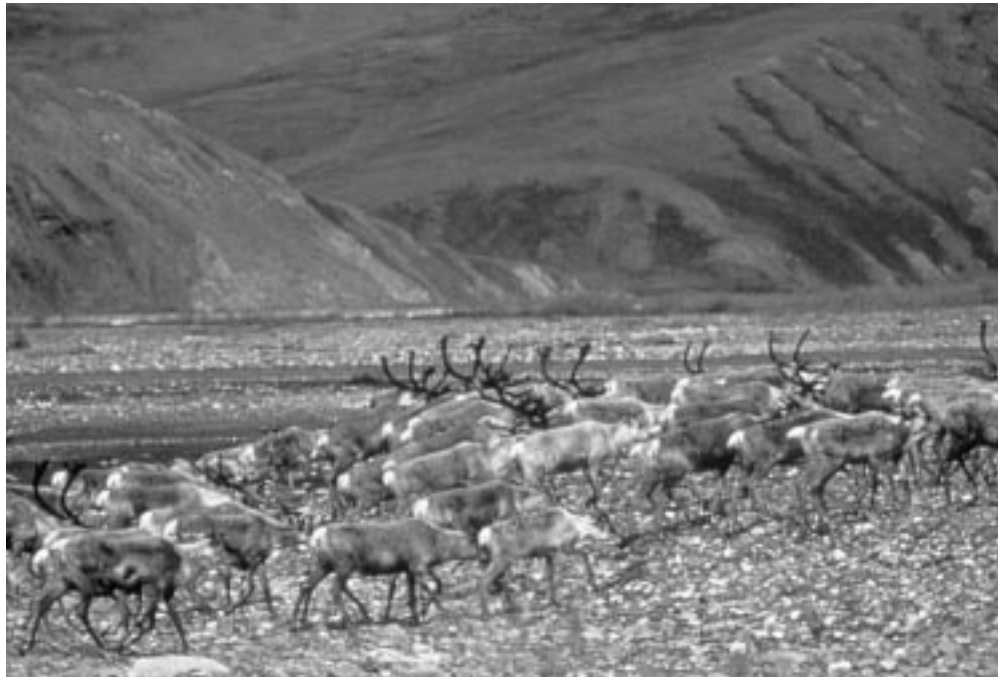
Caribou at Arctic National Wildlife Refuge in Alaska. USFWS photo.

Ken Burton, Public Affairs, Washington, DC