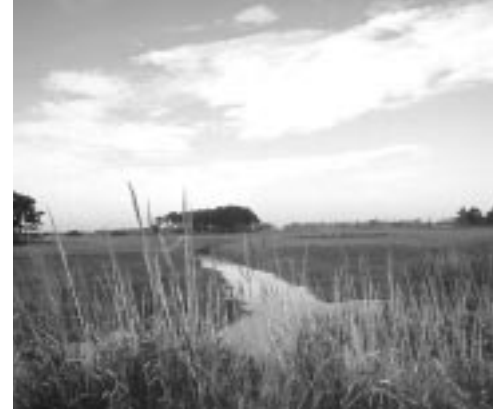
Chincoteague National Wildlife Refuge.

Many others in the Division of Refuges in Washington, DC, also assisted with preparations for the conference.