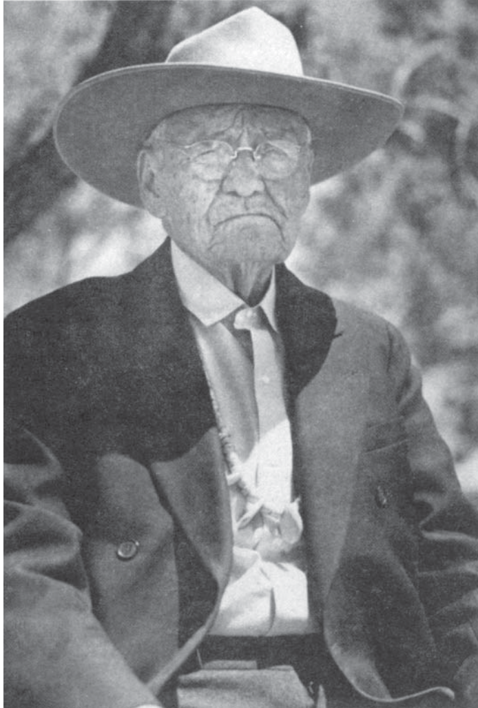
Henry Chee Dodge.