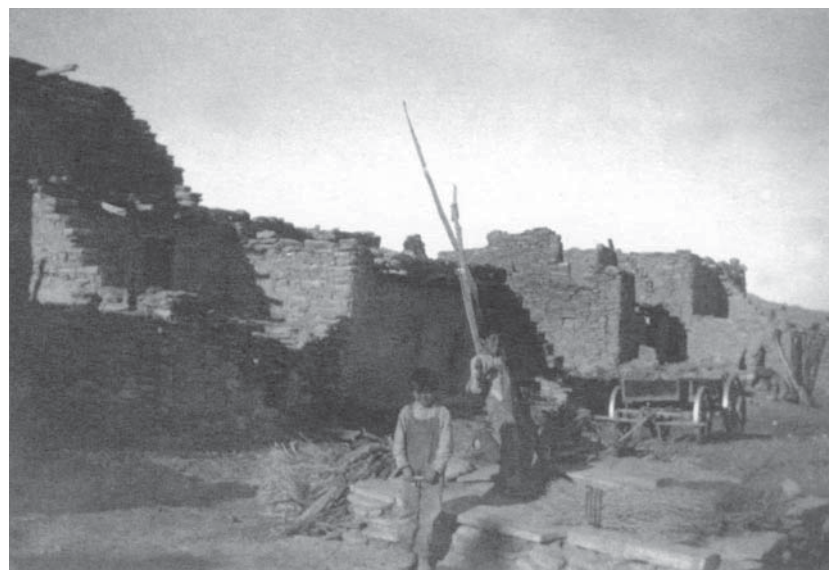
Oraibi homes.