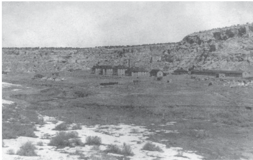
Keams Canyon Boarding School.