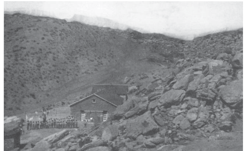
Toreva Indian School children.