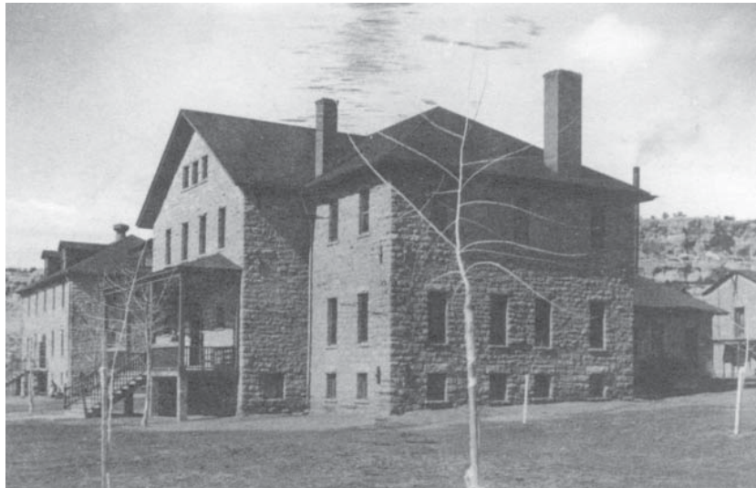
Keams Canyon school building.