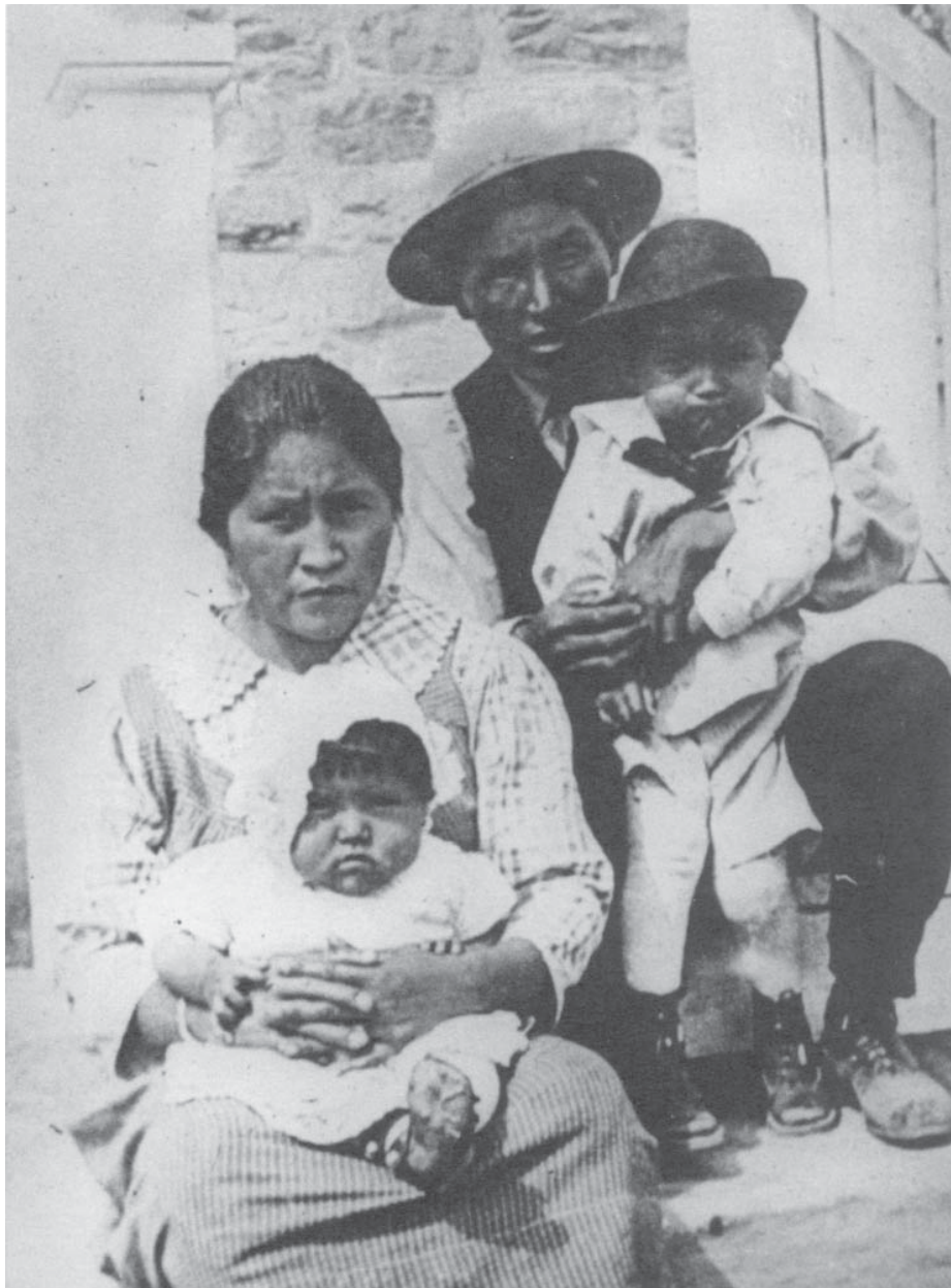
"A progressive Hopi family."