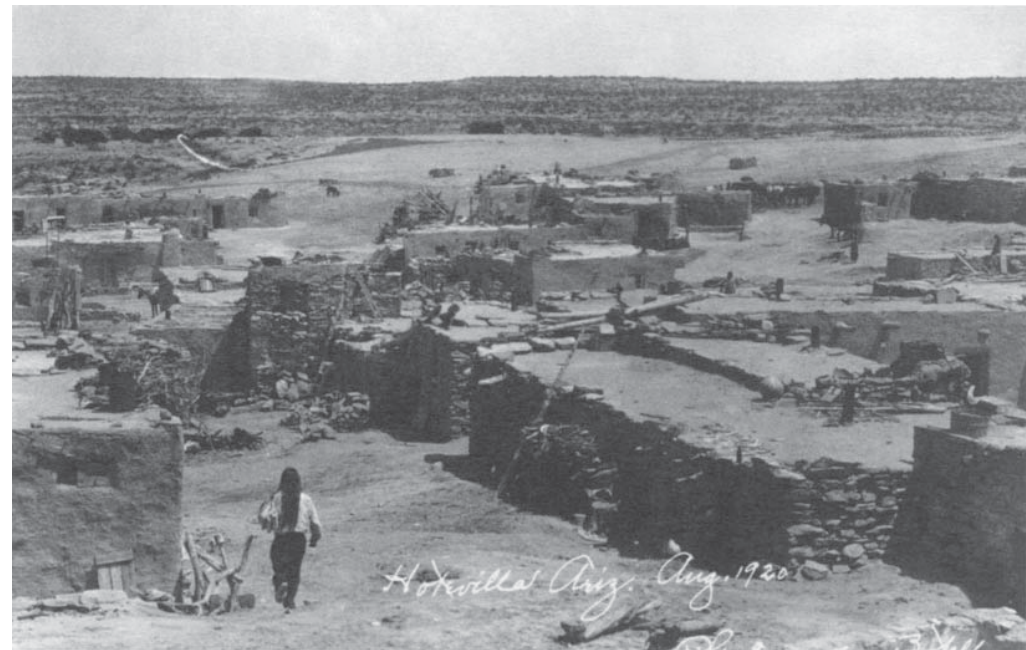
Hotevilla.