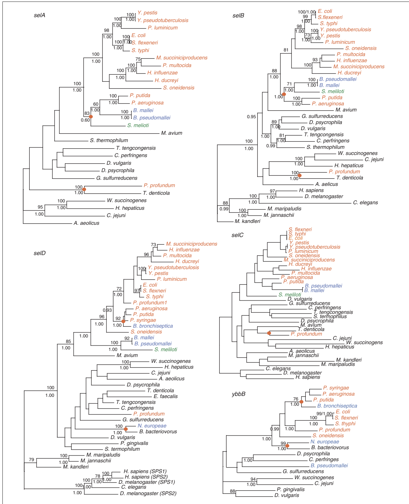
Figure 2 (see legend on previous page)