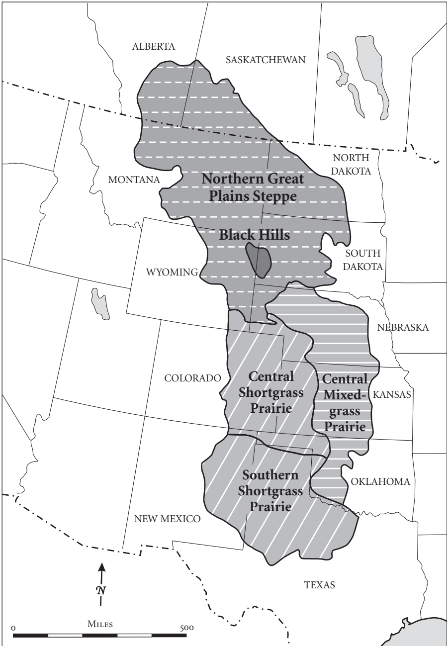
Ecoregions of the Great Plains. After the Nature Conservancy (1999).