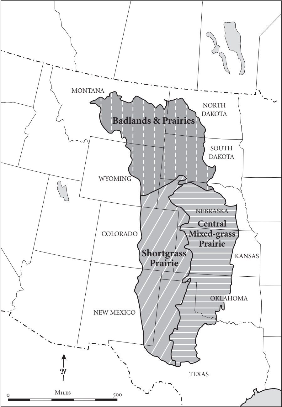
Bird Conservation Regions of the High Plains. After the North American Bird Conservation Initiative Committee (2000).