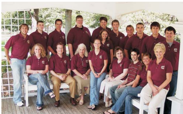
Summer interns and staff for P3 in 2006