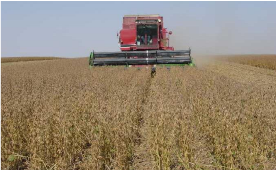
Tracking harvest yields from this narrow-row York County soybean field was part of NU Cooperative Extension's on-farm research in fall 2001. About 20 producers in York, Hamilton, Clay and Fillmore counties annually team with extension to conduct the research.