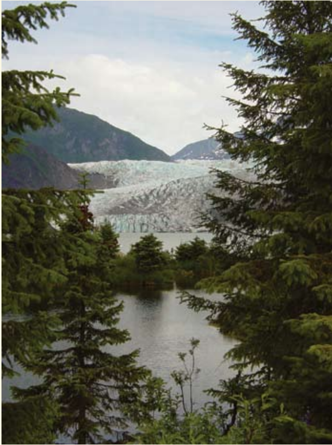
Climate change strategic and action plans are expected to take their final forms in late 2009, reflecting input from Service employees.

W ith the U.S. Fish and Wildlife Service seeking employee comments on a draft climate change strategic plan and five-year action plan, the issue has moved front and center as never before. Although the Service does not expect to issue its final strategic plan until late 2009, the Refuge System, as well, has been analyzing how climate change will affect national wildlife refuges and has been assembling approaches to help solve unprecedented challenges.