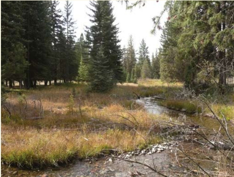
Blackfoot Valley National Wildlife Refuge is composed entirely of land protected by a patchwork of conservation easements, the result of the U.S. Fish and Wildlife Service building lasting relationships with ranchers and showing respect for their way of life. (Noah Kahn)