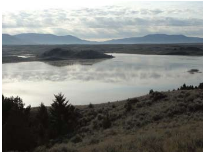
The Partners for Fish and Wildlife Program is an indispensable program that helps the Service accomplish its broad objectives. (Noah Kahn)

Refuges are the lovable land base; the public face; the non-regulatory "good cop" of the Service. The positive experiences that refuge and Partners staff are creating for rural Montanans