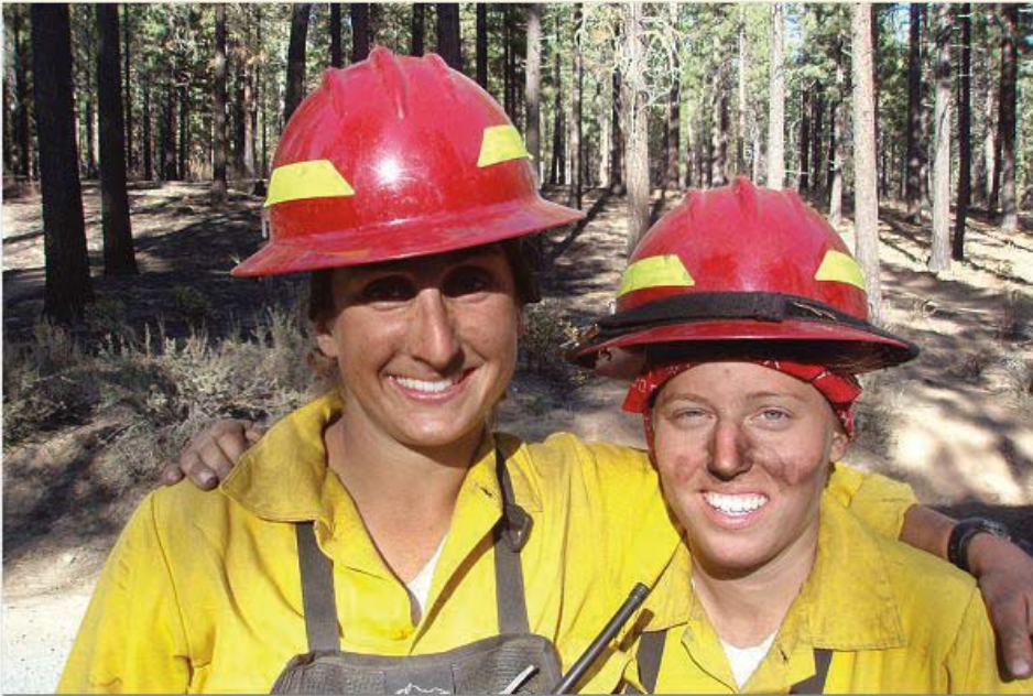
The Northeast Region's fire program has trained 85 AmeriCorps members for duty alongside seasoned wildland firefighters. Another class starts in March.

Point, MD, for duty alongside seasoned wildland firefighters.