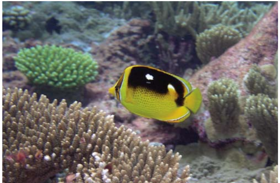
Seven pristine national wildlife refuges in the Central Pacific – remote coral reef ecosystems that support hundreds of fish species and large numbers of nesting birds – are included in three new marine national monuments. The U.S. Fish and Wildlife Service will manage nearly all of the new monuments. (Jim Maragos, USFWS)

S ix national wildlife refuges – remote coral reef ecosystems that contain hundreds of thriving fish species and support large numbers of nesting seabirds and migratory shorebirds – are at the heart of the Pacific Remote Islands Marine National Monument, one of three marine national monuments announced on January 6.