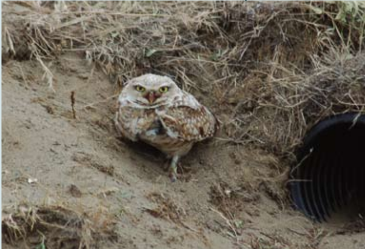
To provide additional nesting habitat for burrowing owls, 18 artificial burrows were installed at an Army facility in Oregon with the help of refuge biologists. Most were quickly occupied by young owls.

Assembling the owl condos (as they're called) isn't a complicated process. It requires taping together plastic barrels and buckets and connecting them to an entrance tunnel – 10 feet of flexible drainage pipe too small for most predators, including coyotes, to crawl