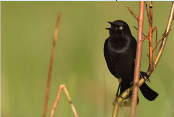
At Alaska's Tetlin Refuge, researchers are examining the nesting habits and habitat affinities of the rapidly disappearing Rusty Blackbird and relating these findings to the boreal forest landscape. (David Shaw)