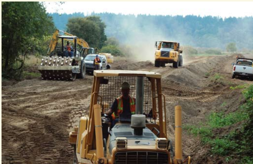
In the Northwest’s largest estuary restoration project, Nisqually National Wildlife Refuge, WA, is restoring 762 acres of former farmland and fresh water wetlands back to an estuary.

In addition to funding from the U. S. Fish and Wildlife Service and Ducks Unlimited, more than $4.5 million in grants has come from, among other sources, all five watersheds in south Puget Sound using Puget Sound Acquisition and Restoration funds and Salmon Recovery Funding Board dollars, the Estuary and Salmon Restoration Program administered by the Washington Department of Fish and Wildlife, the Puget Sound Partnership, National Oceanic and Atmospheric Administration, Environmental Protection Agency and National Fish and Wildlife Foundation.