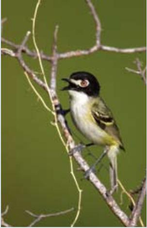
At Balcones Canyonlands Refuge in Texas, a primary research challenge involves monitoring the health and habitat of two species of endangered songbirds, the golden-cheeked warbler and the black-capped vireo (USFWS).

habitat is shaped by fire and vegetation disturbance such as the removal of juniper and grazing. Finding effective ways to manage vireo habitat on a tight budget has required us to be creative with hand-cutting, mechanical treatments and prescribed burning.