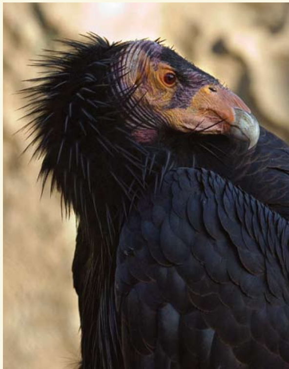
With the addition of seven wild California condor chicks in California and two more in Arizona during 2008, the wild population of the endangered birds now outnumbers those in captivity for the first time since condors were first reintroduced in 1992.