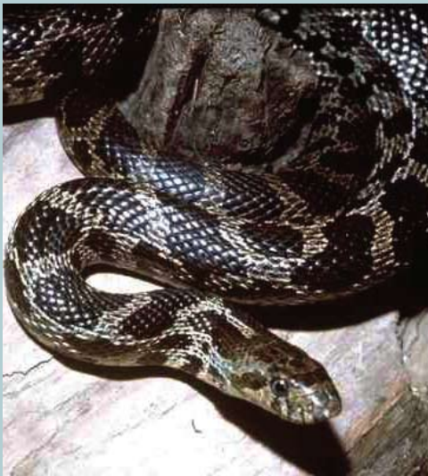
At Michigan's Shiawassee National Wildlife Refuge, researchers are studying one of the most threatened and least understood reptiles in the Midwest – the eastern fox snake.