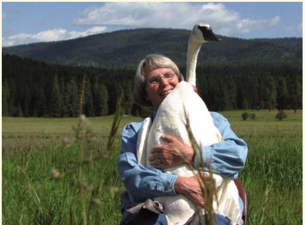
Montana's Blackfoot Challenge, a private nonprofit organization whose partners include more than 500 land owners, works with the U.S. Fish and Wildlife Service to preserve the diverse habitat, wildlife and beauty of the Blackfoot River Valley.