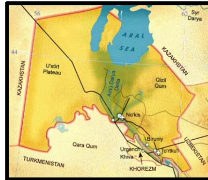
Figure 2, Map – Qaraqalpaqstan

Qaraqalpaqs are about 30% of the 1.5 million population of Qaraqalpaqstan. They are scattered in some provinces of Uzbekistan, and Afghanistan, where they had to assimilate with the local communities. The history and material culture of the Qaraqalpaqs were studied in depth by Russian scholars in the 1920's–1980's. The most important research was undertaken by the Khorezm Archaeological–Ethnographical Expedition of the USSR Academy of Sciences, led by Sergey Tolstov and Tatiana Jdanko. In addition, a significant number of publications about Qaraqalpaq textiles have been published both by Soviet scholars in the 1950's-1970's, and more recently, my presentations at the Stockholm Ethnographic museum (1999), the British Museum (2000), the Institute of Central Asian Studies in Vienna (2002) and in the USA at ICOC (2003). This task is being continued by David and Sue Richardson, private researchers from the UK whose website is the most extensive source of information on the QQP in the English language.