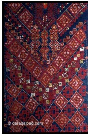
Figure 9, ko'k ko'yilek detail