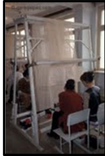
Figure 12, Contemporary carpet weaving workshop