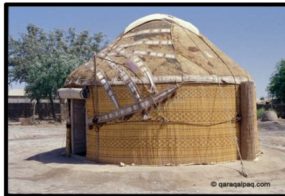
Figure 4, Qaraqalpaq yurt

Lets turn now to the QQP people and their lifestyle. Qaraqalpaqs were semi-nomadic. Their traditional dwelling construction was the yurt, (Fig. 4) thus providing the development of textiles, which were widely produced and used for yurt decorations, clothes and as everyday utensils. The peculiarities of the Qaraqalpaq yurt ( qara uy ) mostly lie in its textile designs, in which it differs from other Central Asian ones. Igor Savitsky regarded it as the most beautiful one in Central Asia. The yurt was widely used until the 1970's and continues to be used to this day as a place for leisure and escape from the heat of the summer.