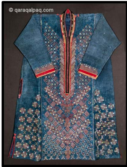
Figure 8, ko'k ko'yilek wedding dress

However the most unusual pattern on the ko'k ko'yilek is the sirg'a nag'is or earring pattern. This only occurs on this dress and does not appear on any other QQP embroidery.