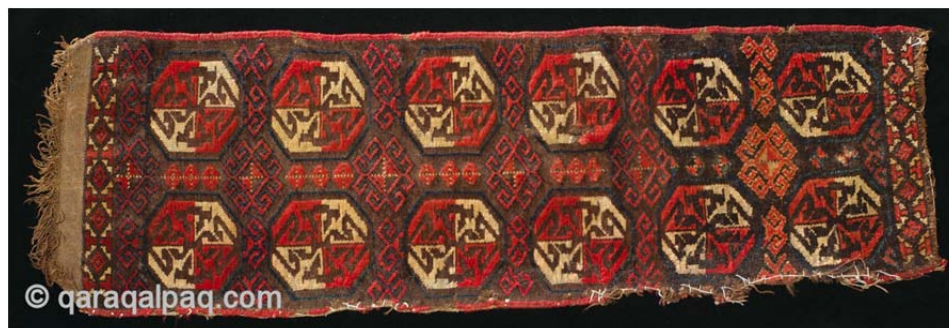
Figure 5, Pile weaving yesiq-kas panels which sat above the interior of the door