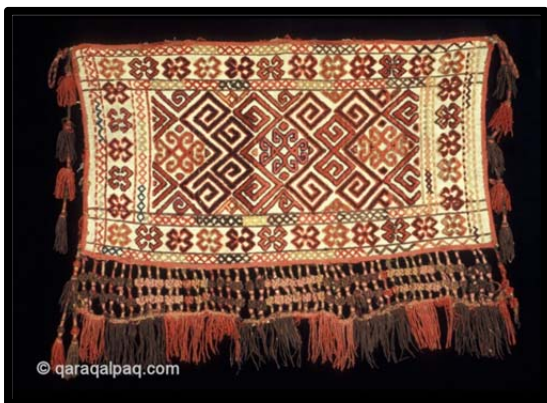
Figure 6, Mixed technique – kergi

Flat woven items – qizil-basqur , qizil-qur and several other qurs , dasturqan table cloth, etc. (Fig. 7)