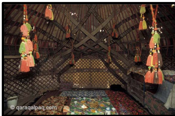
Figure 7, Yurt interior

Elena Tsareva, head of textile research at the Kunstkamera Museum in St. Petersburg, Russia and formerly at Peter the Great Museum of Anthropology and Ethnography and scholar of ethnographic textiles of Central Asia and Turkmen carpet weaving from St. Petersburg, classified pile-woven items into 16 designs and singled out 7 types of compositions. She stated at the same time, that both flat-woven and mixed technique pieces require further investigation.