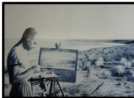
Figure 3, Igor Savitsky – self portrait

The museum I represent is named after Igor Savitsky. He came to Qaraqalpaqstan in 1950 as one of the team of the afore-mentioned Khorezm Archaeological–Ethnographical Expedition. He documented the findings and drew the castles and fortresses, where the excavations were held. (Fig. 3).