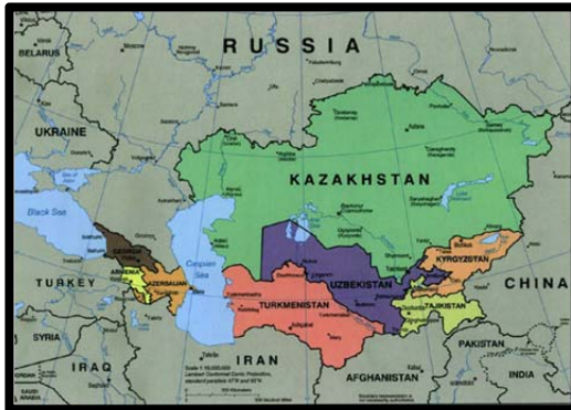
Figure 1, Map – Central Asia

Let me start this session by answering a basic question you may have been asking yourselves – where on earth is Qaraqalpaqstan? Well it is in the western part of Central Asia, situated to the east of the Caspian Sea occupying nowadays north–western part of Uzbekistan, and lying south of the almost shrunk Aral Sea. It borders Kazakhstan and Turkmenistan (Figure. 1 and 2).