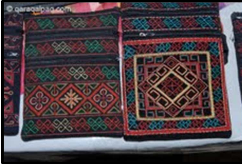
Figure 11, Contemporary embroidery

These skills, however, have not completely died out among the Qaraqalpaq. Every year a competition is held to find the “Woman of the Year”. The competitors have to show their skills at reciting traditional poetry and cooking along with examples of their needlework. The Savitsky museum also encourages these skills through the sale of embroidered items in its gift shop. (Fig. 11) In addition we have established a carpet workshop where we train women in the art of traditional weaving. (Fig. 12)