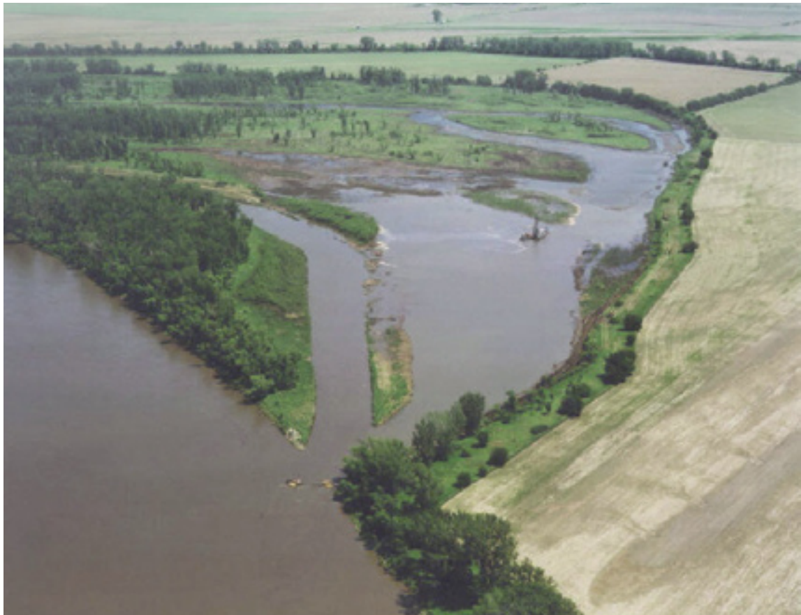
Dredging of a backwater area along the banks of the Missouri River is part of the U.S. Army Corps of Engineers habitat construction programming.

Twenty-three piping plovers and 64 interior least terns hatched and were successfully fledged from the constructed emergent sandbar island complex, making them the most productive sandbar islands on the Missouri River for interior least terns last year.