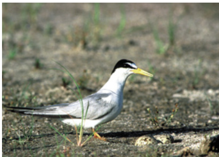
An adult least tern feeds her chicks.

DMS is an Internet-based data depository. Once the data is in DMS, it undergoes a quality check and after approval, is available to users in a series of reports.