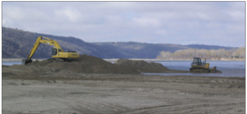
Creating emergent sandbars in the Missouri River (photo: U.S. Army Corps of Engineers).

Monitoring created habitat is crucial to understanding what meth-