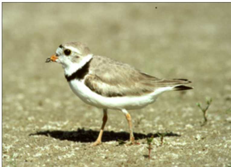
A piping plover nests on a sandbar (photo: U.S. Army Corps of Engineers).

When a nest is found, crews record the location with GPS and document species, number of eggs, egg incubation stage and nest fate. In the office the data is downloaded via computer into the Corps' Threatened & Endangered Species Data Management System (DMS).