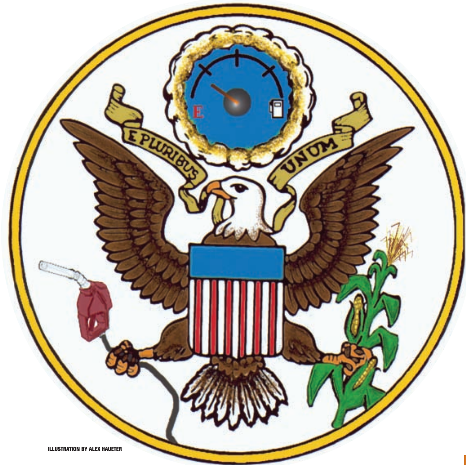
ILLUSTRATION BY ALEX HAUETER