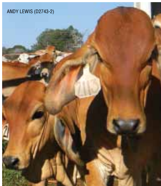
Brahman calves just before transport to Lubbock, Texas. Each calf’s stress response will be monitored before, during, and after transport to determine whether temperament is linked to the amount of stress experienced in transport.