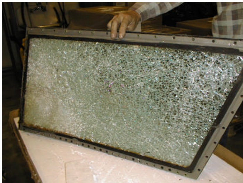
Top to bottom: China Air @ Vancouver; Air Ontario props vs. geese @ Toronto City; Canada 3000 Airbus vs. vulture; ProAir B737 windshield vs. goose over New York