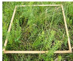
Sampling Plot

Lindsey Reinartz has finished three samples of herbivory rates and insect sweeps. Insect analysis and identification are nearly complete.