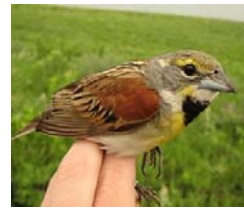
Male Dickcissel, Tallgrass Prairie National Preserve in Kansas.

CURRENT STATUS: Park sites are Pipestone National Monument, MN; Homestead National Monument, NE; and Tallgrass Prairie National Preserve, KS. Research is targeting four species of grassland birds, dickcissel ( Spiza americana ), grasshopper sparrow ( Ammodramus savannarum ), eastern meadowlark ( Sturnella magna ), and western meadowlark ( S. neglecta ).