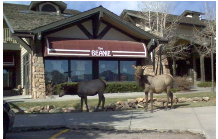
Elk que early to beat the Christmas shopping rush in Estes Park, Colorado.

So, what should you submit. Articles about current events in wildlife damage management, brief articles about current research, news from your part of the world, and other information of interest to members.