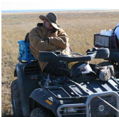
Your new editor hard at work in South Dakota.

I am currently the Wildlife Disease Biologist for USDA APHIS Wildlife Services in Indiana (and Ohio). My Bachelor's degree is in Wildlife Management from the University of Georgia Warnell School of Forest Resources (1998) I obtained my M.S. and