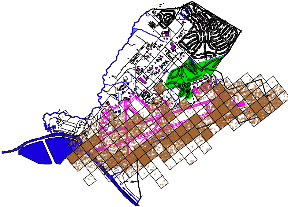
Figure 1. All bird species observed on Seymour Johnson Air Force Base between November 2001 and October 2002.

GIS also showed the distribution of mammals on the airfield and allowed viewers to easily distinguish between mammals that pose a greater hazard to human and aircraft safety at SJAFB (white-tailed deer) compared to those whose hazard to aircraft is not as great (opossums, foxes, etc.) (Figure 2).