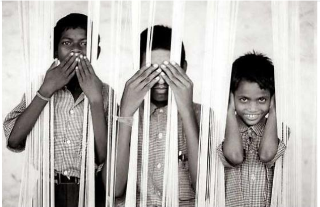
Faces of Freedom exhibit, GoodWeave