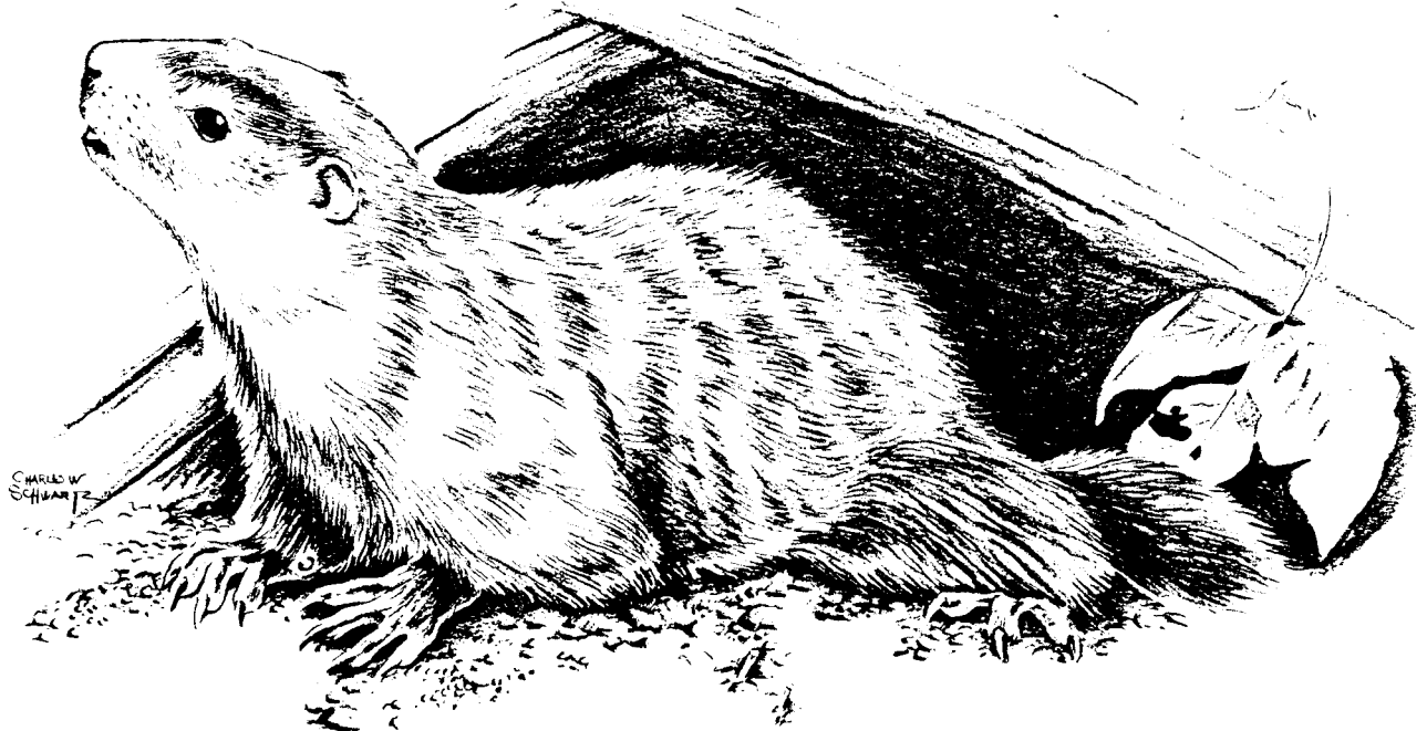
Fig. 1. Woodchuck, Marmota monax