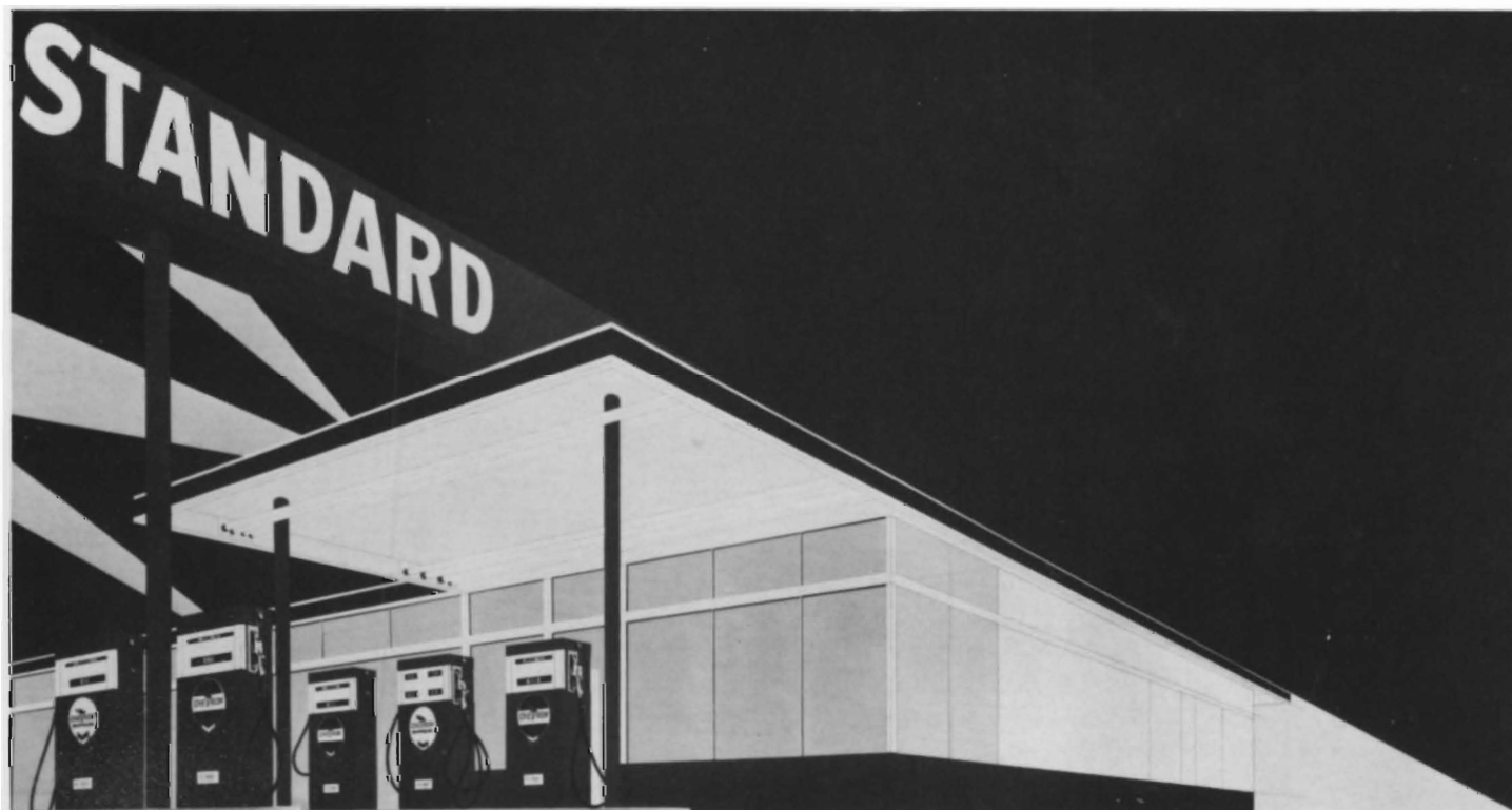
STANDARD STATION, AMARILLO TEXAS, 1963. ( Not in the exhibition.) Illustration courtesy of Hood Museum of Art, Dartmouth College, Hanover, New Hampshire