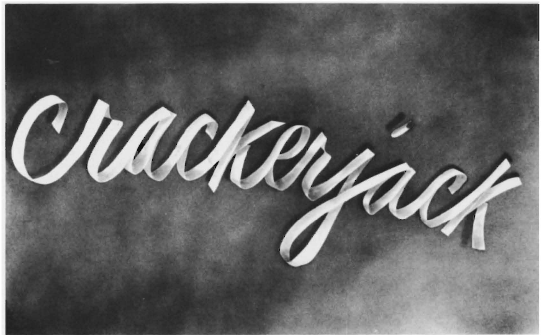
CRACKERJACK, 1967, graphite on paper, 15 x 23 1/2 in.

This physical presence is reiterated in other works, such as a series of paintings done in the late 1960s, in which Ruscha presented the word as if it were written with a