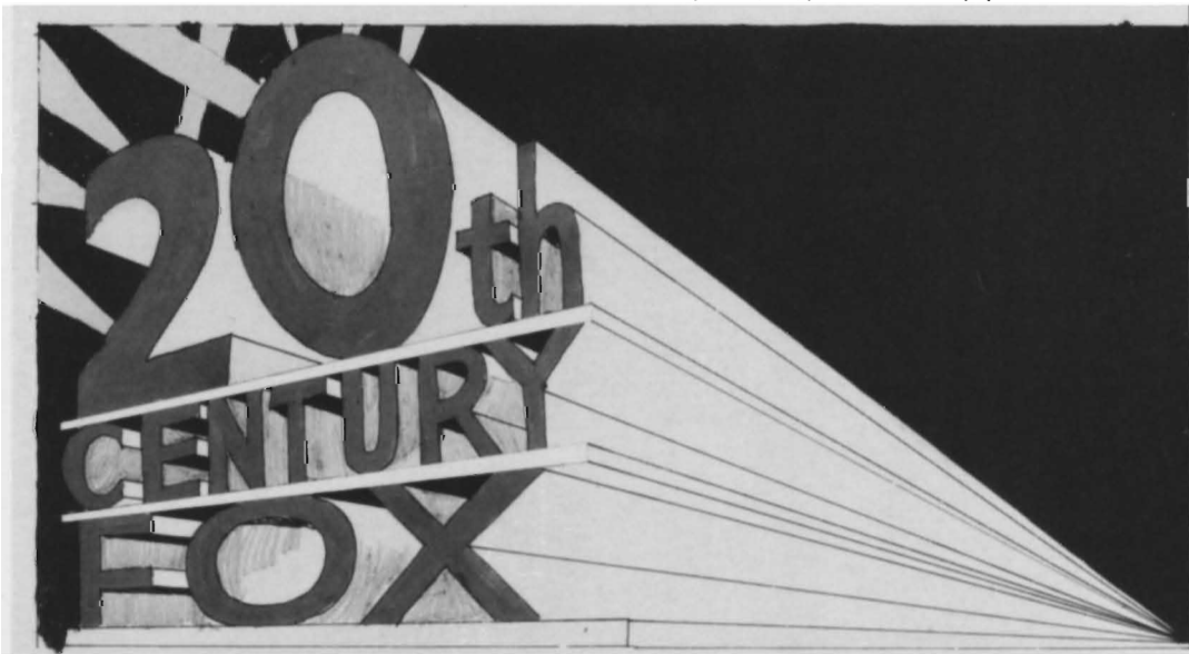
TRADEMARK 2, 1962, ink, pencil and oil on paper 8 5/16 x 14 1/2 in.

In the 1970s, Ruscha began to focus on isolated words on the canvas, rather than invoking words as an integral part of a specific product or symbol. His works of this period are appropriate illustrations of many of the conceptual issues with which artists at the time were grappling. These paintings ►