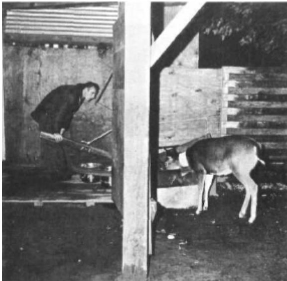
Fig.2. Preference-testing apparatus with one door open to show observer and shutter-opening lever.