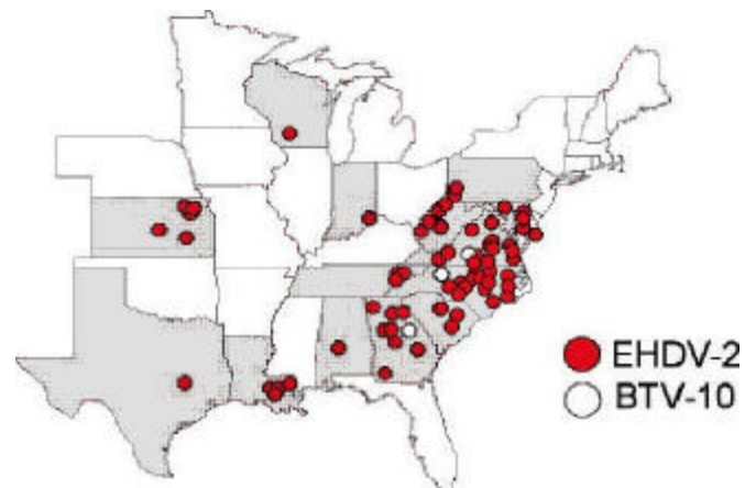
Figure 1: Virus isolations by location, 2002

The spatial distribution of EHDV-2 during 2002 exhibited a slight expansion from the typical range of HD as determined from data collected since 1981 through SCWDS's annual questionnaire. The known distribution of HD in white-tailed deer corresponds very closely to the reported range of the biting midge Culicoides sonorensis , a recognized vector for both the