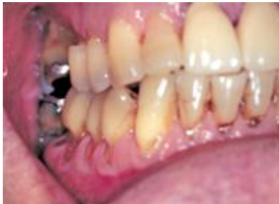
Figure 1. Multiple illustrations of abfraction lesions as indicated by arrows. Note the wedge-shaped notch and the eccentric occlusion, which has placed tensile forces at the cervical areas of both anterior and posterior teeth of both arches.

Abrasion can be accelerated by erosion, as the combined effect of abrasion and erosion is greater than either process on its own. 23-25 In one study that compared abrasion and erosion, the outcome of the two processes combined was 50% greater than the outcomes from either of the processes alone. 25 In a literature review on NCCLs, Bartlett and Shaw 8 concluded that there is overwhelming evidence from clinical and laboratory studies that abrasion and erosion are linked to NCCLs, yet data also support the theory that NCCLs are caused specifically by abrasion or erosion alone.