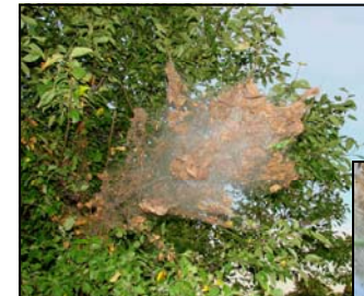
Web at end of branch typical of fall webworm