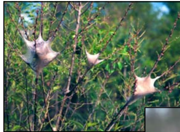
Tents in branch forks built by eastern tent caterpillar