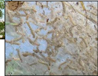
Fall webworm caterpillars in web