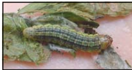
Mimosa webworm caterpillar