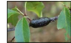
Egg mass on cherry twig