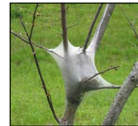
Eastern tent caterpillar

Many caterpillars that feed on trees produce webs, tents or bags, which provide the insects protection from predation and poor weather. This publication will discuss the identification and management of these common pests.