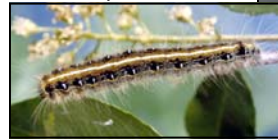
Mature eastern tent caterpillar