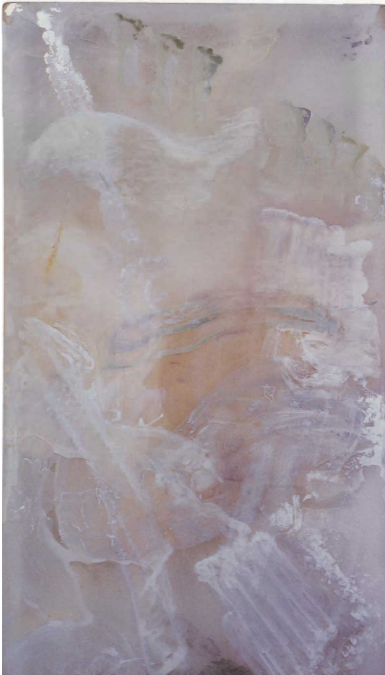
GLACIAL TWIST, 1996, acrylic sheet, 60 x 34 in.