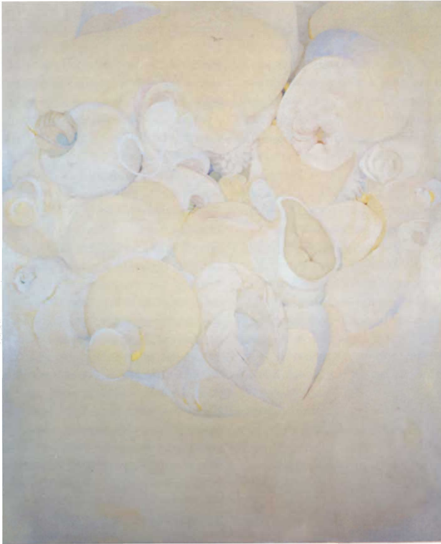
FIRST WHITE PAINTING, 1966, oil on canvas, 81 x 68 in.

the history of twentieth-century modernism. Wassily Kandinsky, in his influential color theory, first published in 1912, acknowledged white's familiar associations with "joy and spotless purity," yet he attributed more complex symbolic meanings to it: "white, although often considered as no color ...is a symbol of a world from which all colors as material attributes have disappeared.... [It] acts upon our psyche as a great, absolute silence, like the pauses in music that temporarily break the melody. It is not a dead silence, but one pregnant with possibilities. White has the appeal of the nothingness that is before birth, of the world in the ice age." 5 Herman Melville likewise found in white a peculiar force, "a dumb blankness, full of meaning," at once "the most meaning symbol of