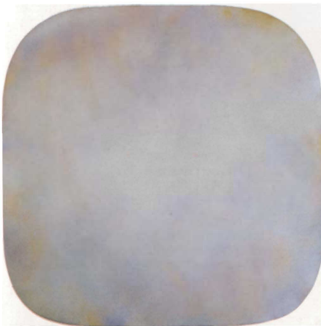
LILEM I, 1974, acrylic on canvas, 60 1/2 x 60 1/2 in.

In the intervening years Haerer had produced series of dark paintings and drawings which she described as "the subterranean side of the white paintings. They speak of deep forces under the earth that rumble, expand, and push, of the earth's energy which causes great forests to grow and lava to burst forth." These images draw their inspiration from sources as diverse as the late, dark paintings of Goya, another of the objects of her admiration, and memories of blackened lava fields in Hawaii. In these works,