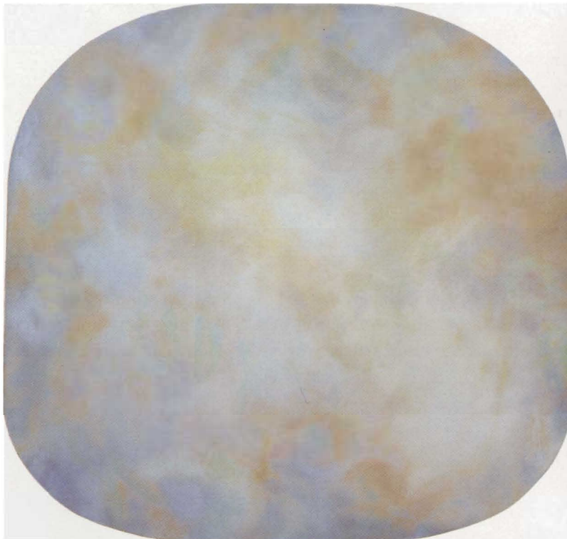
LILITH, 1973, acrylic on canvas, 97 x 101 in.