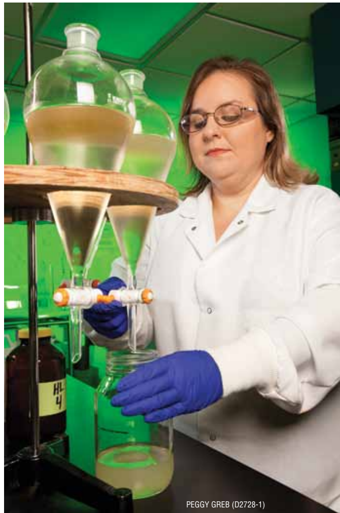
PEGGY GREB (D2728-1)

The researchers wanted to see if they could make these good results even better. They were already familiar with the riser pipes producers placed at the edge of drainage ditches to create a dam that temporarily impounds runoff. This reduces runoff volume and velocity, which in turn reduces field erosion. It also helps raise the water table, which improves crop access to soil water.