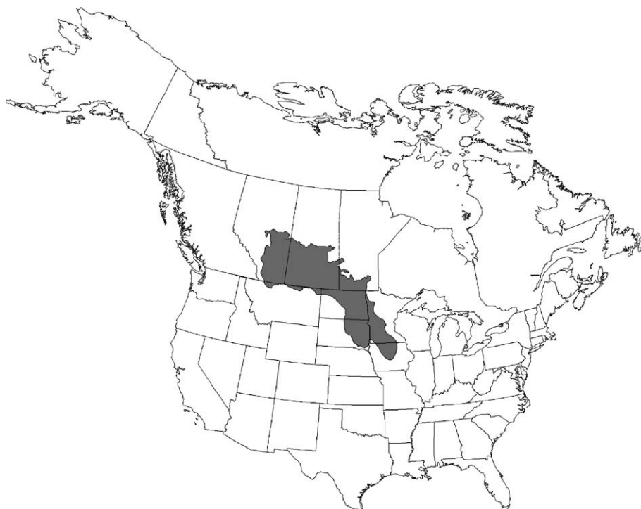
Fig. 1. The prairie pothole region of North America.

extensively developed for agriculture. Consequently, >50% of the wetland area in the PPR of the United States (Tiner, 1984) and 71% in Canada (Environment Canada, 1986) have been drained for agricultural development. Although ground-based sink studies have found cropland and grassland soils to be important for carbon storage (Lal et al., 1999), carbon storage in wetlands has not been evaluated. Wetlands make up 23% of the land area in the PPR, and they are important components of the global ecosystem, performing many important functions, including carbon cycling (Mitsch and Gosselink, 2000). Extensive conversion of PPR wetlands for agricultural production has stimulated considerable interest in restoring previously farmed wetlands for conservation purposes (Knutson and Euliss, 2001). To determine the impact of this practice on the storage of atmospheric carbon, we compared the soil organic carbon content of undisturbed PPR wetlands to those with a previous history of cultivation. We also calculated a regional estimate of the potential carbon storage in wetlands because the PPR is within the zone (i.e., below 51°N) thought to represent a large