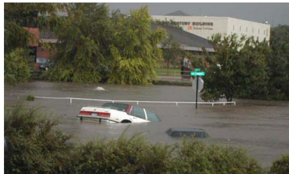
AND THE RAINS CAME. Despite enduring drought conditions in the Lincoln area this year, torrential rains caused flash flooding in many areas of the Capitol City on Aug. 28 as seen in this photo.