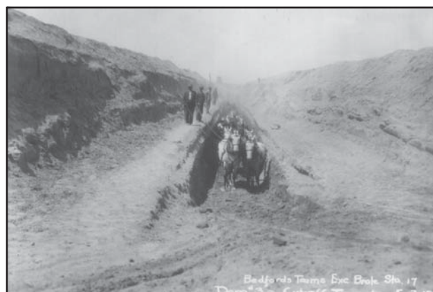
Teams of horses and men excavate brule clay from the cut-off trench at Minatare Dam in May, 1913.

On the following pages, the Bureau's projects in eastern Wyoming and Nebraska are detailed, including looks at the irrigation districts that run them and the area offices that administer them.