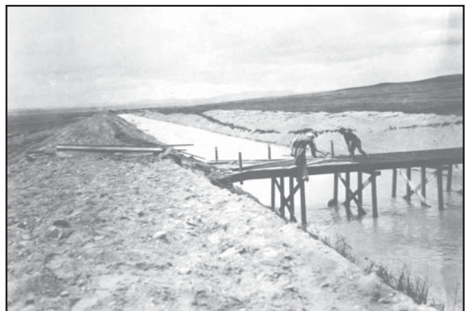
One of the many irrigation canals and laterals laboriously built in Nebraska in the early part of the 20th century to help irrigate more croplands.