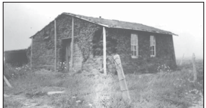
It's almost hard to imagine that many plains settlers were still living in sod houses like this one when the U.S. Reclamation Service began building major irrigation projects in Nebraska and eastern Wyoming in the first decade of the 20th century (USBR photo).