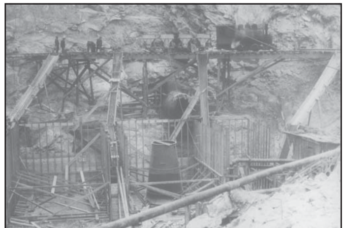
Construction on the Guernsey powerplant in January, 1927.