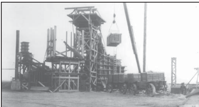
Construction of Minatare Dam in western Nebraska, like many early Reclamation projects, included having to elevate skips containing gravel into a hopper that screened the gravel. This photo dates to November, 1912. For perspective, that's little more than seven months after the ocean liner RMS TITANIC struck an iceberg and sank in the North Atlantic.