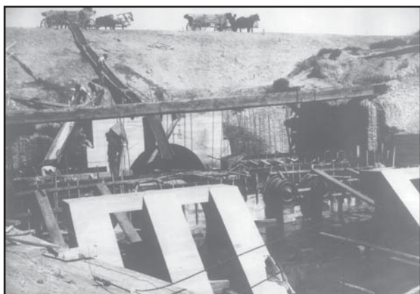
Construction of the south end of the conduit of Minatare Dam, September, 1913 (USBR photo).

Farmers in Nebraska, Wyoming and other states west of the Missouri River continually battled alternating droughts and floods in trying to break western lands to the plow. Their collective voice for stable supplies of water reached new heights in the 1890's, when a drought struck settlers so hard that many of them gave up their dreams of settling the land.