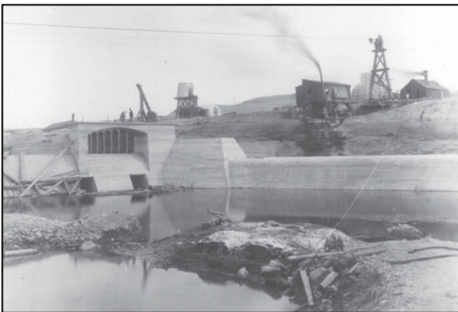
North sluice gates of Whalen Dam with interstate diversion gates in the background. View looking upstream from construction. Date unknown.