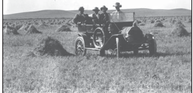
Plains farmers survey their land in western Nebraska, probably in the teens or 1920’s. Exact date unknown. U.S. Bureau of Reclamation projects to “reclaim” the arid western lands and control flooding were in large measure responsible for Nebraska’s agricultural successes. As the Bureau of Reclamation celebrates its Centennial this year, look inside this issue for the history and details of the projects it built in Nebraska and eastern Wyoming..