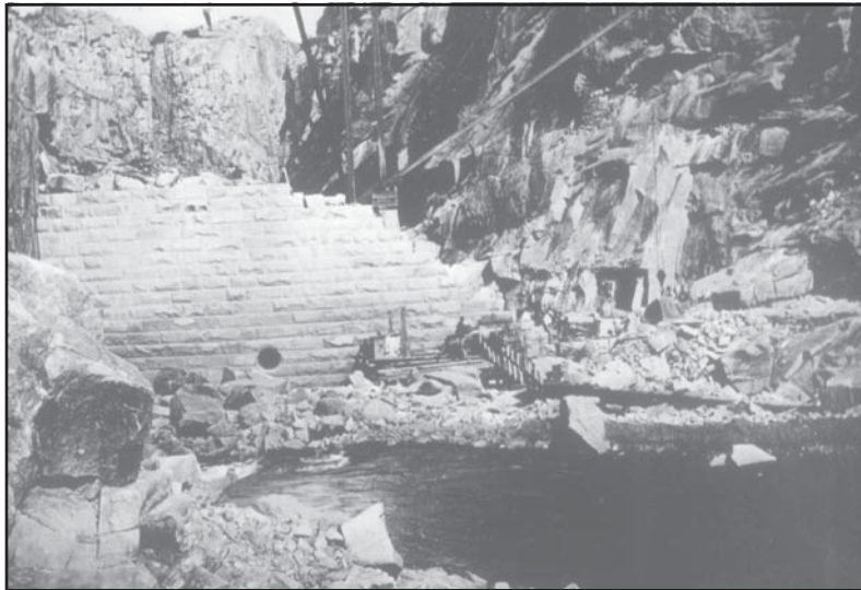
Building Pathfinder Dam in August, 1907. The dam was completed in 1909.

A small reregulating dam called Gray Reef also is part of the Glendo Unit. It ensures a continuous flow of water downstream of Alcova Powerplant. Gray Reef was also completed in 1961.