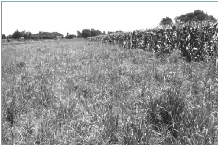
Grass Buffer in Riparian Zone

Grass buffers in uplands and riparian zones are tracts of land with permanent grass cover. The purposes of buffers are to (1) remove contaminants in water that is flowing to the stream, (2) improve the stream environment and stabilize the banks, (3) enhance wildlife habitat, and (4) provide for biological diversity in the landscape. Sediment removal from water flowing on the land surface is one of the key water quality benefits of conservation buffers.