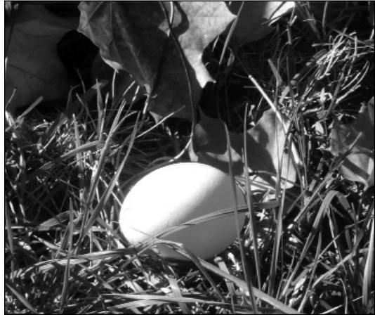
Figure 3. An egg placed on the treadle at the Green Canyon Ecology Station, Logan, Utah.

Investigator-induced depredations are often a concern in nesting studies because researchers may increase depredation risk by depositing odor trails to nests, disturbing vegetation around nest sites, or being observed at the nest site by a predator (Strang 1980, Götmark et al. 1990, Skagen et al. 1999, Bêty and Gauthier 2001). The importance of investigator-induced