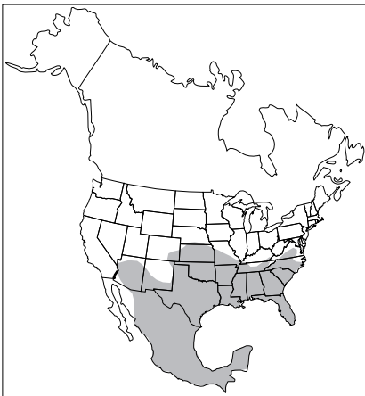
Fig. 2. Range of the hispid cotton rat in North America.

The total length averages 10 inches (25 cm) including the tail length of 4 inches (10 cm). The cotton rat may be distinguished from the Norway rat by its smaller size, shorter tail, and longer grizzled fur. Evidence of cotton rat presence are stem and grass cuttings 2 or 3 inches (5 or 8 cm) in length piled at various locations along runways, which are 3 to 5 inches (8 to 13 cm) wide. Pale greenish or yellow droppings, about 3/8 inch (9 mm) in length and 3/16 inch (5 mm) in diameter, may also be present along the runways.