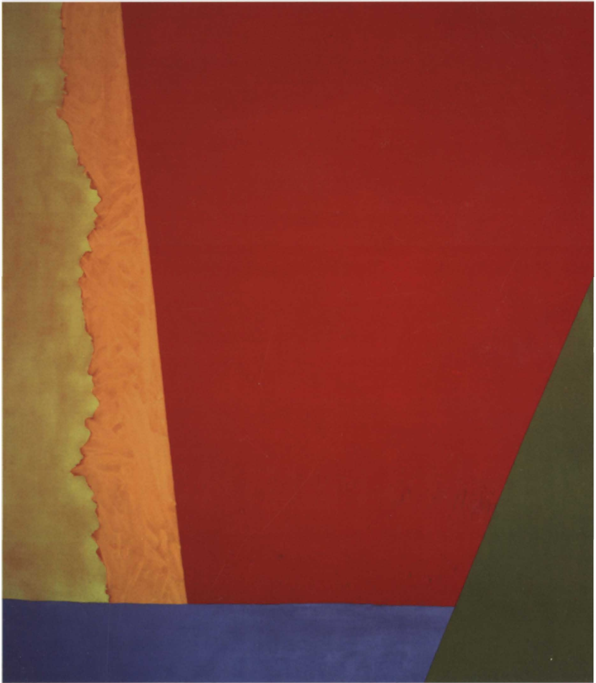
DAN CHRISTENSEN, LISA'S RED , 1970, ACRYLIC ON CANVAS, 102 X 88 INCHES, COLLECTION OF THE KEMPER MUSEUM OF CONTEMPORARY ART, KANSAS CITY, MISSOURI, BEBE AND CROSBY KEMPER COLLECTION, GIFT OF THE ENID AND CROSBY KEMPER FOUNDATION 1995.15

SHELDON MUSEUM OF ART • OCTOBER 23 THROUGH JANUARY 31, 2010