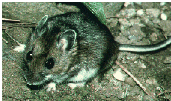
The Deer Mouse

Cabins that have been closed for the winter can become nesting sites for mice, shrews and other rodents. These animals can carry fleas, ticks, viruses or other organisms on their skin, in their droppings or urine. These can cause diseases in humans, especially when you breathe in the dust from their droppings or nesting sites.