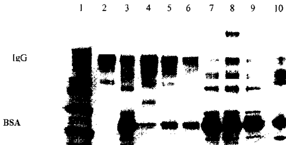
FIGURE 3 Sodium dodecylsulfate (0.1%)-polyacrylamide gel (8–16% gradient) electrophoresis of human IgG that was purified from serum using thiophilic cellulose beads. Lane 1 shows a molecular weight ladders. Lanes 2 and 3 show application of pure human IgG and human serum at a total protein level of 6 \mu g, respectively. Lanes 4, 5 and 6 show application of elution fractions obtained from u = 1, 3, \text{ and } 6 cm/min, respectively at a total protein level of 6 \mu g. Lane 7, 8 and 9 shows the fall through fraction obtained from u = 1, 3, \text{ and } 6 cm/min, respectively at a total protein level of 6 \mu g. Lane 10 shows an application of pure BSA at a total protein level of 6 \mu g

stain throughout the cross section. No discernible differences in fluorescent intensities were observed between sections taken from either method A or method B. Thus we were able to install thiophilic sites throughout the cross section of the bead.