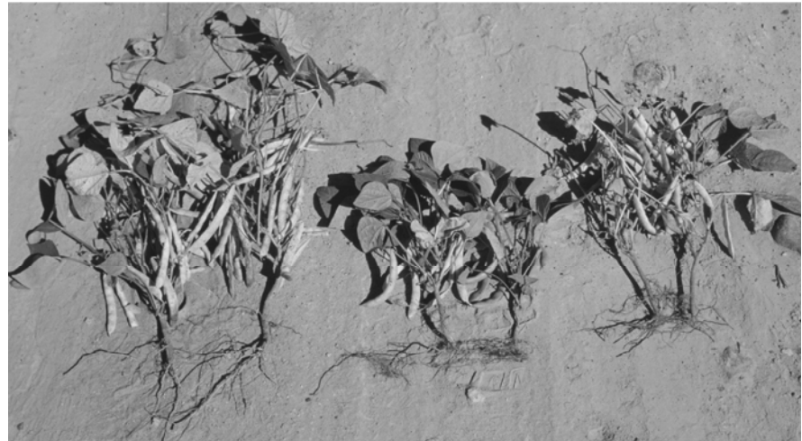
Fig. 3. Effects of compaction and root stress on dry bean plants near harvest (approximately 90 days after planting). From left to right, plants removed from plots treated with: zone tillage, compacted control, and bedding alone, each representing an overall plot vigor rating of 1.0 to 1.5, 4.0 to 4.5, and 3.5 to 4.0, respectively. Note differences in size of plants, number and size of seed pods produced, and degree of root inhibition of plants from non-zone-tillage treatments.

We tried to create a reasonable level of compaction that would simulate field con-