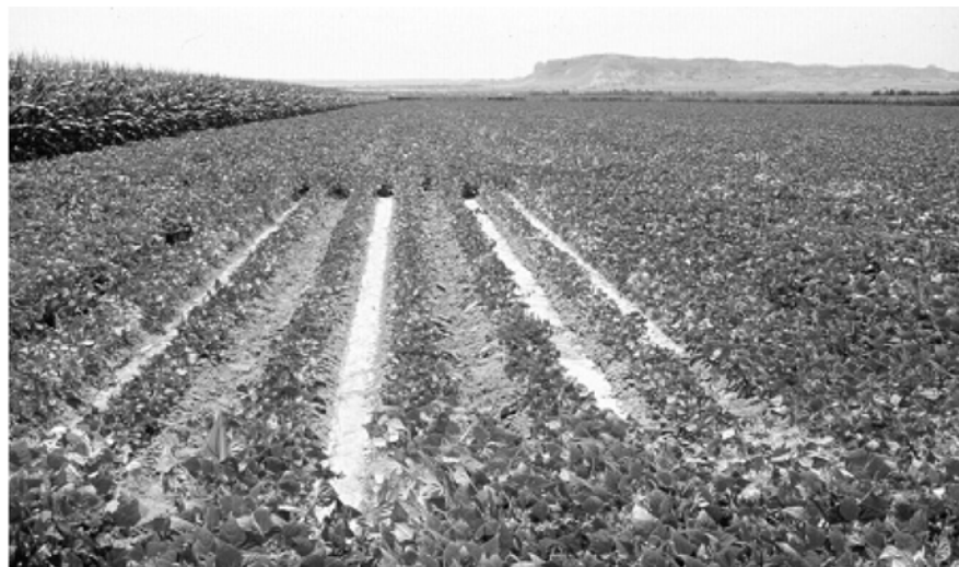
Fig. 2. Effects of compaction on dry bean plant growth at approximately 70 days after planting. Represents a 5 on the vigor rating scale (1 to 5), with 5 being most severe. Note stunting and failure of plants to close rows (<50%) compared with surrounding plots.

Results of contrast analysis illustrating the statistically significant differences attributable to zone tillage effects, and lack of difference among those treatments without zone tillage. The soil resistance values obtained, combined with plant response (disease and vigor ratings; Table 1), indicate that compacted conditions were successfully produced. Those treatments lacking zone tillage had significantly higher soil resistance values, higher disease ratings, and poorer vigor ratings than those including it (Table 1). Individual plants collected from the compacted control treatment were severely stunted with a poorly developed root system, compared with those taken from a zone tillage-