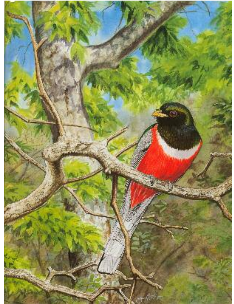
The beautiful Elegant Trogon (above) is the only species regularly found in the United States, where it is highly sought by birders.