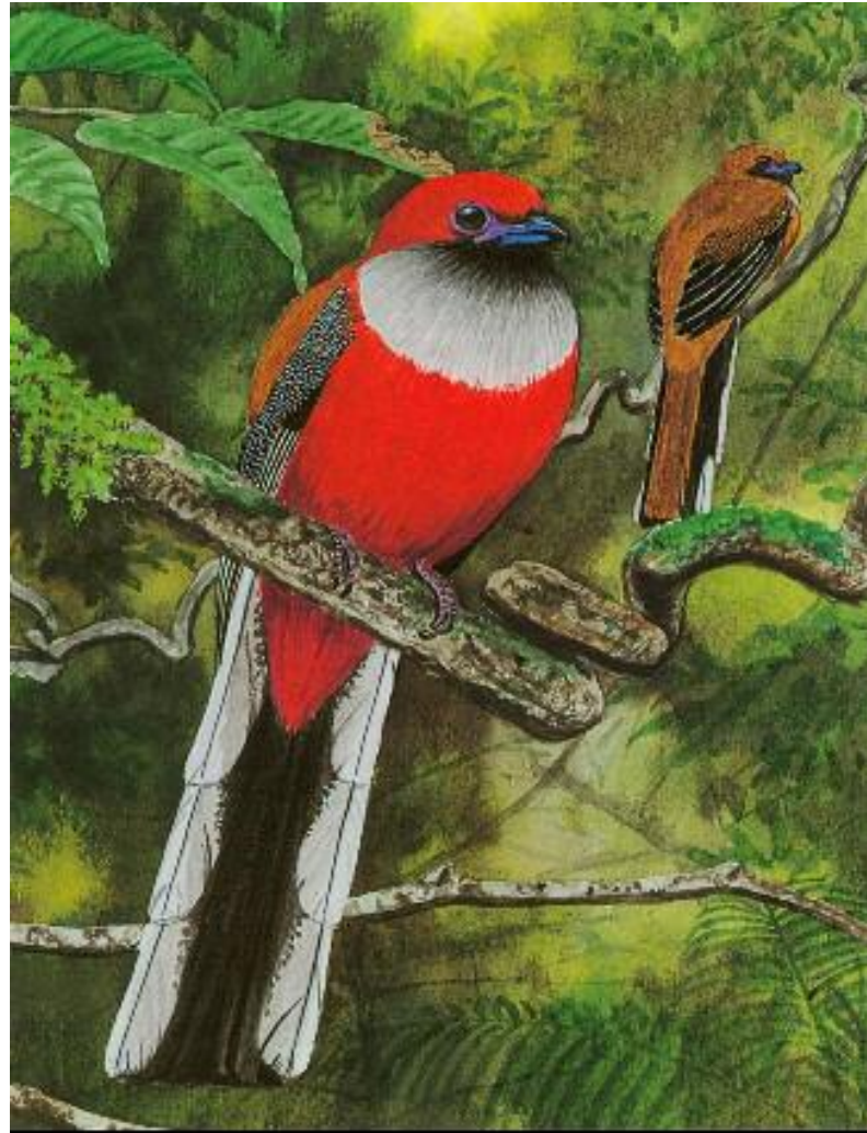
Deforestation in Borneo threatens the Whitehead's Trogon (above), the country's only endemic species, as well as five other species found there. The birds need the dead and rotting trees found in old growth forests to use as nest sites.

"Quetzal" has also found its way into the present-day languages of Mexico and Guatemala, for the now-mythic god Quetzalcoatl was derived from an actual historic Toltec hero, who eventually became transfigured into the Aztec's god of wind and air and a benevolent patron god of the arts and music. Feathers from the male quetzal's train were a symbol of power and status to the Aztecs; only high priests and similar important officials were allowed to own and wear them. In Guatemala, the quetzal myth has been perpetuated by the adoption of the Resplendent Quetzal ( Pharomachrus mocinno ) as the country's national bird symbol, as well as its basic unit of currency. Unfortunately this symbolic status has done nothing to benefit the species in Guatemala, where poaching of the Resplendent Quetzals for their skins and capturing them alive for the illegal aviculture trade—plus rampant deforestation of their cloud-forest habitat—have a disastrous effect on their population.