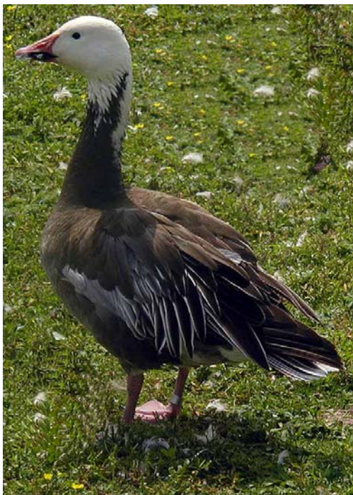
Lesser Snow Goose at Slimbridge Wildfowl and Wetlands Centre, Gloucestershire, England.

wintering areas for as long as possible. This procedure had its predictable outcome last winter, when a large flock of geese and ducks that were concentrated on Lake Andes National Wildlife Refuge in southern South Dakota were affected by a severe outbreak of viral enteritis, or "duck plague" which killed thousands of waterfowl. The affected geese were Canada geese rather than snow geese, but the potential for a disaster of comparable or even greater magnitude certainly exists with the latter species.