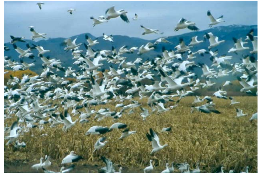
Snow Geese wintering at the Bosque del Apache, New Mexico; note blue-phase bird at far left.