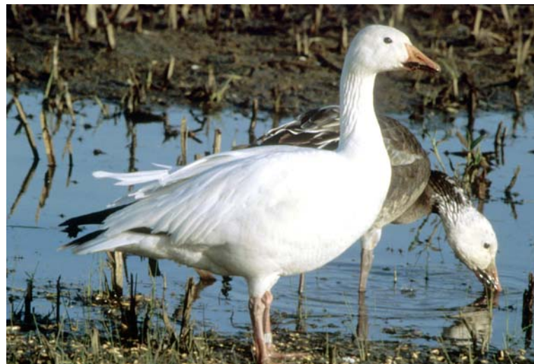
White and blue phases of lesser snow goose.

initial stages of the breeding season. It is possible that, as the snow and ice covering the tundra begins to disappear—shortly after the first eggs are laid in late May or early June, depending on the latitude of the colony site—white-phased birds on the nest are more conspicuous to predators.