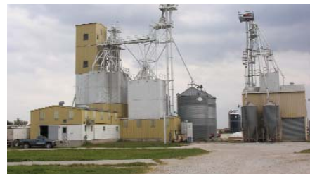
The feedmill at the ARDC is operated by UNL's Department of Animal Science.

The feedmill processes about 300 tons of feed per month. Feed made in the mill is mixed in one of two one-ton mixers. All the swine and poultry diets are mixed in one mixer and all beef, FEEDMILL - Cont. on P. 2