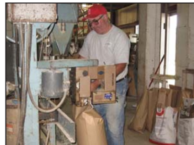
The feedmill has dried distillers grains in 50 lb. sacks, so that it can be fed as a meal in a supplement.

in by semi trucks and unloaded on the flat concrete areas. The grains are then loaded