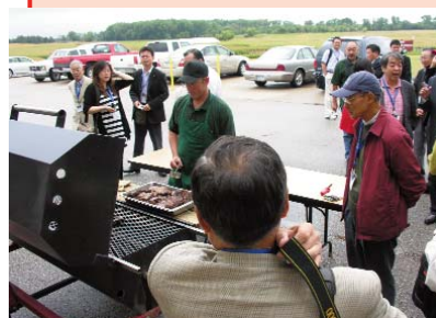
The Nebraska steaks on the grill garnered attention and pictures from the group.

Governor Heineman hosted the state's first reverse trade mission tour this fall. More than 125 guests from eight nations visited Nebraska. The event was devised to encourage international companies to explore opportunities for investment in Nebraska. Nearly 40 people from the group, accompanied by representatives from the State Department of Agriculture, made a stop at the ARDC. □