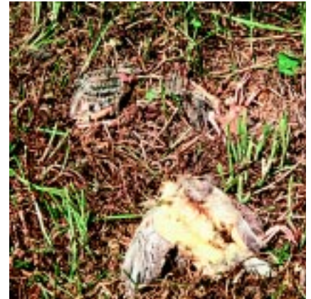
Nest mortality caused by haying

Although the breeding season is the most critical time of year for most species, birds also need suitable habitat during the migration periods and winter. Few studies have examined bird use of CRP habitats in the Great Plains during those time periods. King and Savidge (1995) reported use in Nebraska by American tree sparrows, ring-necked pheasants, red-winged blackbirds, western meadowlarks, horned larks, and northern bobwhites. Delisle and Savidge (1997) noted only American tree sparrows, ring-necked pheasants, and meadowlarks (eastern and western meadowlarks were not distinguishable) wintering on their Nebraska study areas. For Kansas, Best et al. (1998) indicated that American tree sparrows, ring-necked pheasants, meadowlarks, northern bobwhites, and dark-eyed juncos were fairly common in CRP fields.