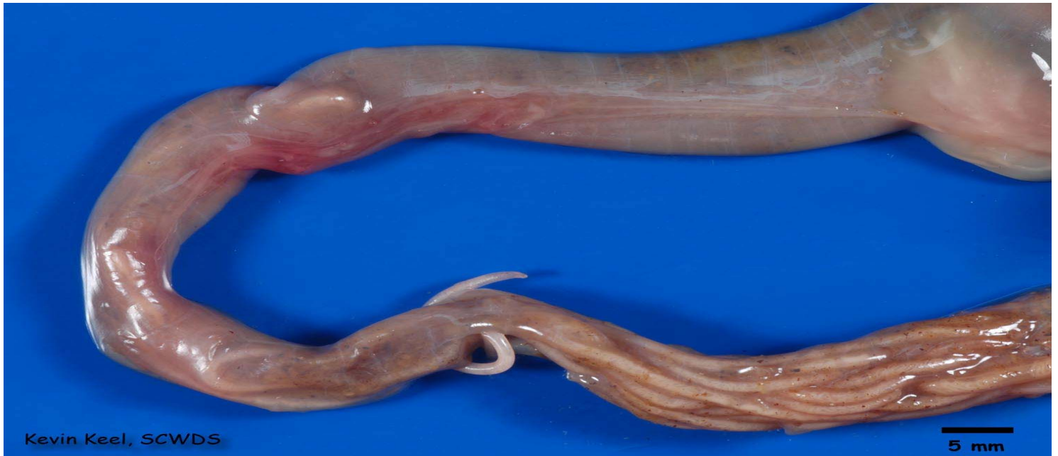
Mourning dove intestine impacted and distended with A. columbae .

winged doves, but significantly higher than that of mourning doves. However, it currently is unknown if Eurasian collared-doves directly affect helminth intensities in mourning doves in areas where the two species are sympatric.