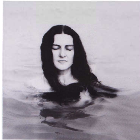
Harry Callahan, Eleanor, Chicago , 1949, gelatin silver print, 9 5/8 x 9 1/2" UNL-FM Hall Collection