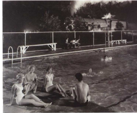
O. Winston Link, Swimming Pool at Welch, West Virginia , 1958, gelatin silver print, 16 x 20" UNL-EM: Hall Collection