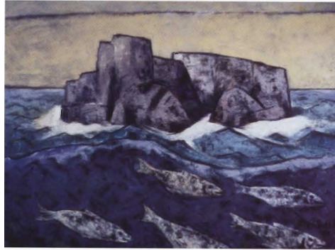
Bror Julius Olsson Nordfeldt, Sea, Rocks and Fish , 1950, oil on canvas, 37 x 48" UNL-FM Hall Collection

Peter de Lory grew up on Cape Cod where he began photographing at a young age. His hand-colored photograph Arm in Water serves as a metaphor for humanity's relationship with and dependence on water. Water makes up most of the human organism. It cools and cleanses body and