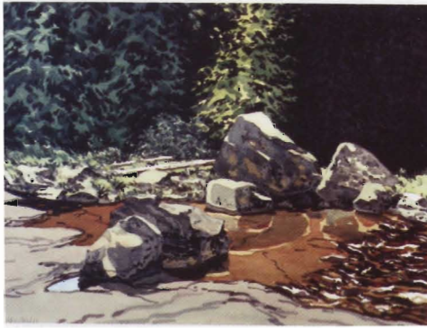
Neil Welliver, Cedar Pond , 1976, watercolor, 21 3/4 x 28 3/4" NAA Collection

Neil Welliver painted in nature, inhabiting a place until he had observed all its intricate details and felt a certain oneness with it. Despite their inaccessibility, Welliver sought out remote areas to paint, completing only large canvases in his studio and limiting his palette to eight colors. Like his other watercolors, Cedar Pond was influenced by Japanese prints. Instead of using calligraphy, however, he painted an area with watercolor