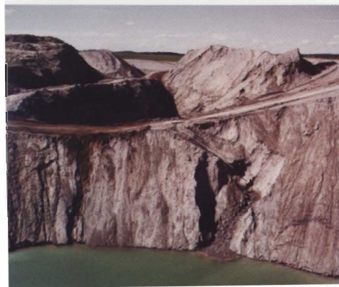
David Taverner Hanson, Mine Spoil Piles and Waste Runoff Water , not dated chromogenic color print, 8 15/16 x 11" UNI-EM: Hall Collection