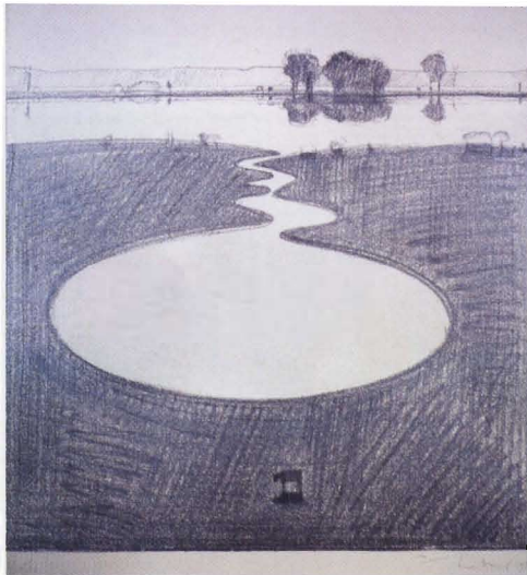
Wayne Thiebaud, Silver Landscape , 1971, color serigraph, 21 5/8 x 21" UNL-EM Hall Collection

Silver Landscape is a continuation of Wayne Thiebaud's exploration of shape in the stylized form of a central pond in a rural setting. Best known for his cafeteria production line of pies and cakes, his concentration on form and simple shapes with well-defined shadows is central to his work. In Silver Landscape Thiebaud achieves strong definition by varying light and dark tones. To create spatial dimension, he places a lone cow in the foreground and scatters nondescript forms indicating brush, animals, or humans in the distance. Thiebaud's scene, unlike most landscapes, consists of little sky and no strong horizon line, thereby emphasizing form.