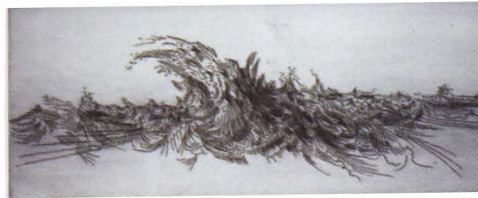
Paul Caponigro, Tide Pool, Nahant, Massachusetts , 1962, gelatin silver print, 9 3/8 x 7 3/8 UNI-EM Hall Collection

In the 1950s William Theo Brown and other San Francisco Bay Area artists turned away from Abstract Expressionism and focused on the figure. Living on the California coast, they made it the backdrop for much of their work. In Brown's Girls Swimming , the faceless, naked figures are reduced to free-flowing shapes in harmony with their watery surroundings. The girls radiate a spirit of playfulness and