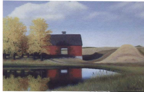
Alice Cumbow, Autumn Reflections , 1951, oil on canvas, 15 1/2 x 23 5/8 NAA-Gift of Mary D. Hillegas

In the late 19 th and early 20 th century, Impressionism became popular in America, its style loosely characterized by fluidity of light and color. Water, supremely embodying this fluidity, became a matchless subject for artists. James McNeill Whistler's dawn and dusk harbor scenes inspired another American artist, Charles Vezin, much of whose work depicted lower Manhattan's harbor and