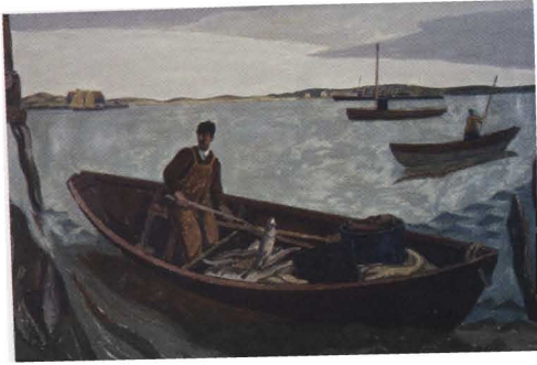
Ross E. Moffett, The Red Dory , 1928, oil on canvas, 20 x 30 3/8" NAA Collection