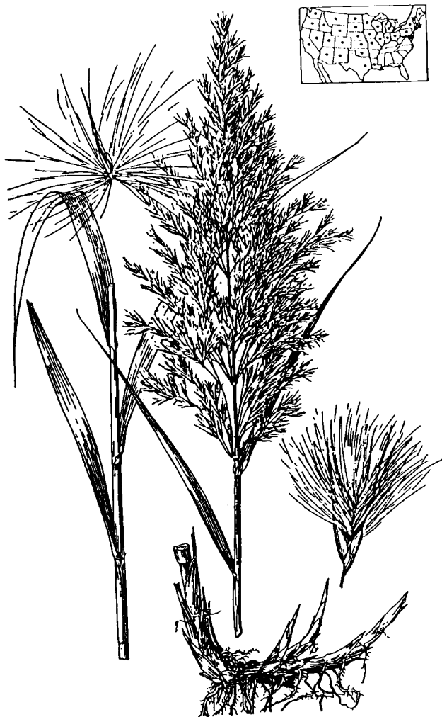
Figure. Phragmites australis plant ( \times \frac{1}{3} ), spikelet and floret ( \times 3 ), and rhizome. Illustration from Hitchcock (1950).

mud roots with small lateral roots that reach down 3 ft (1 m) or more grow from the horizontal rhizomes.