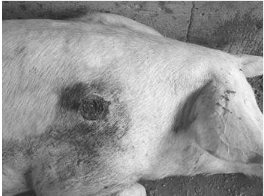
Figure 3. A meaty or dry shoulder ulcer in a sow.

Studies indicate that many risk factors are involved in the development of shoulder ulcers in sows. Some factors are not easy to address. It's clear that lack of animal movement especially during late gestation and early lactation is an important factor in development of shoulder ulcers. Thus, it seems important for caretakers to carefully monitor each sow's lying behavior and attempt to fix any problem that restricts her movement. Also, it might be useful to get sows up soon after they have finished farrowing to relieve