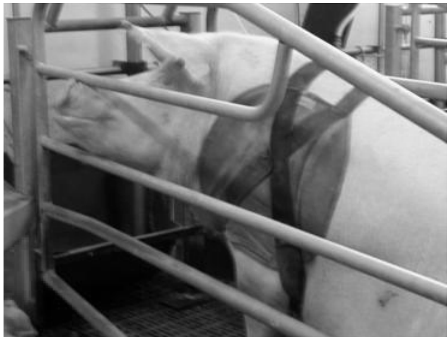
Figure 4. Shoulder pad fixed to a sow in Denmark.

pressure on the tissues in the shoulder. Sows that appear stained or that have indentations of the flooring design on one side probably have been lying on that side for some time. Providing these sows a rubber mat to lie on probably will prevent an ulcer from developing.