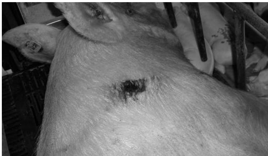
Figure 2. Shoulder ulcer on a sow.

Because the direction of the pressure is from inside out, most of the damage to the underlying tissue already has been done before it finally progresses to the skin (Figure 2).