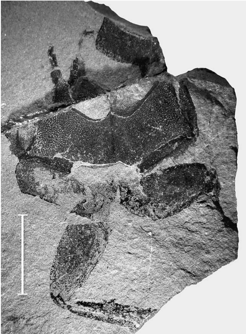
Fig. 1. Oryctoantiquus borealis . Scale bar equals 10 mm.

of the posterior legs, distinguishes Oryctoantiquus from other genera in the tribe Oryctini.