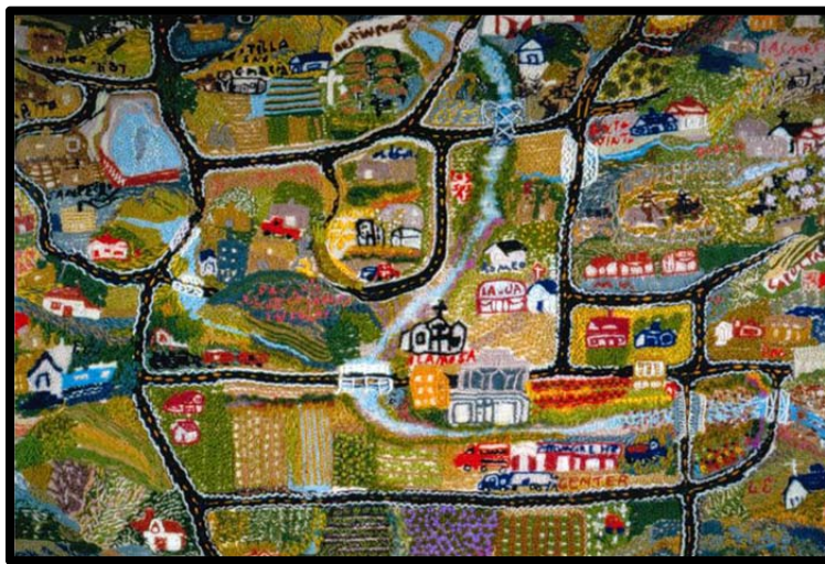
Figure 2. Detail. Embroidered map of San Luis Valley.

Artistically there is a profound feeling of bodily and sensory engagement with this place – not only visual but also in the clarity and brilliance of the air, the tactility and texture of the unfolding landscape, roads known and walked as well as the sonic landscape of rushing water and animal sounds, church bells, and the grinding gears of trucks. Furthermore, through Trujillo's appropriation of cartographic power she has transmuted the geographic isolation into an Edenic vision of industry and reward symbolically separate from the realities of virtual ethnic and social isolation from the rest of Colorado.