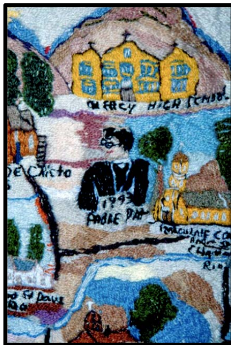
Figure 4. Detail of Las Misiones .