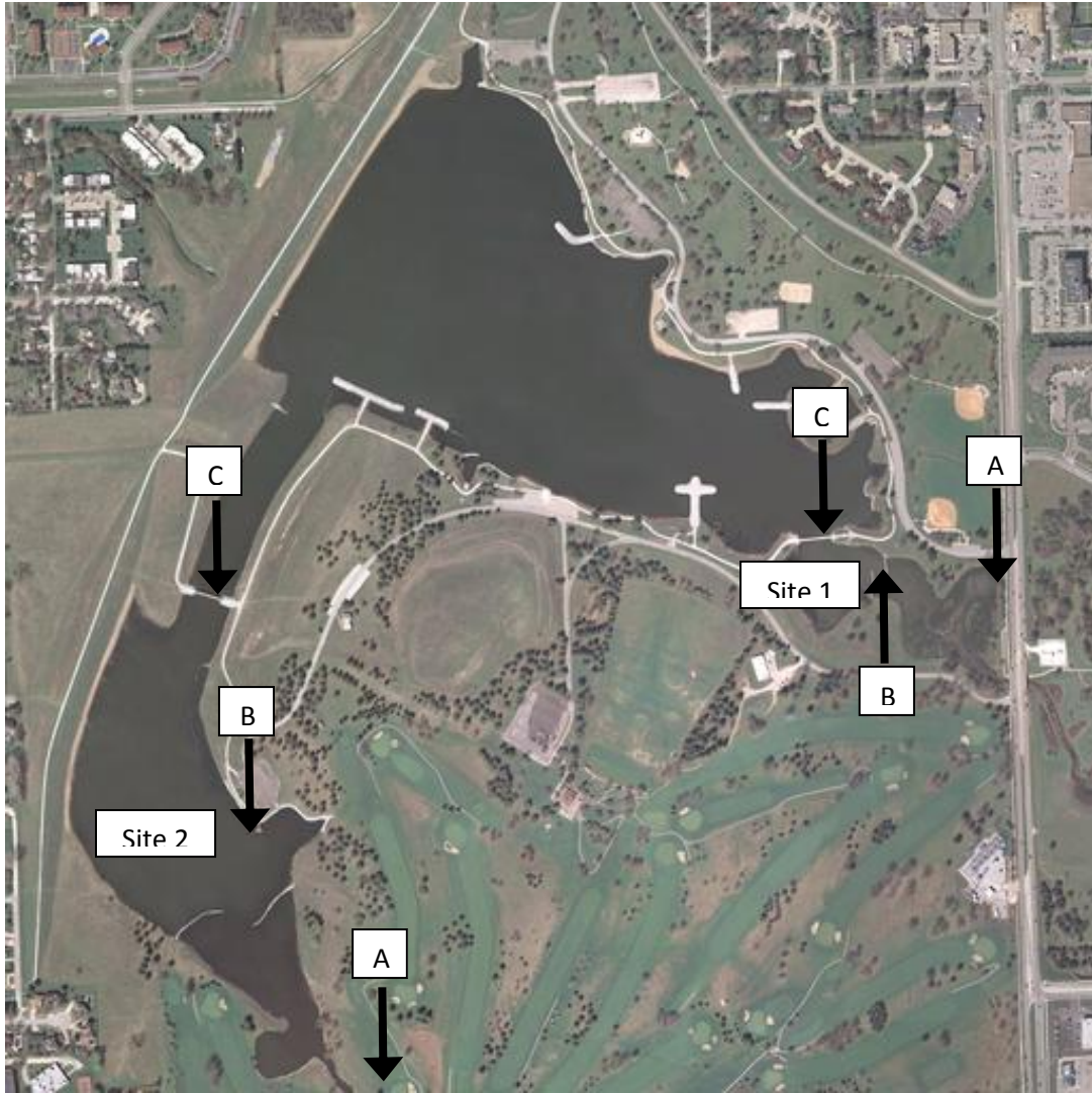
Aerial imagery indicating locations A through C for sites 1 and 2.