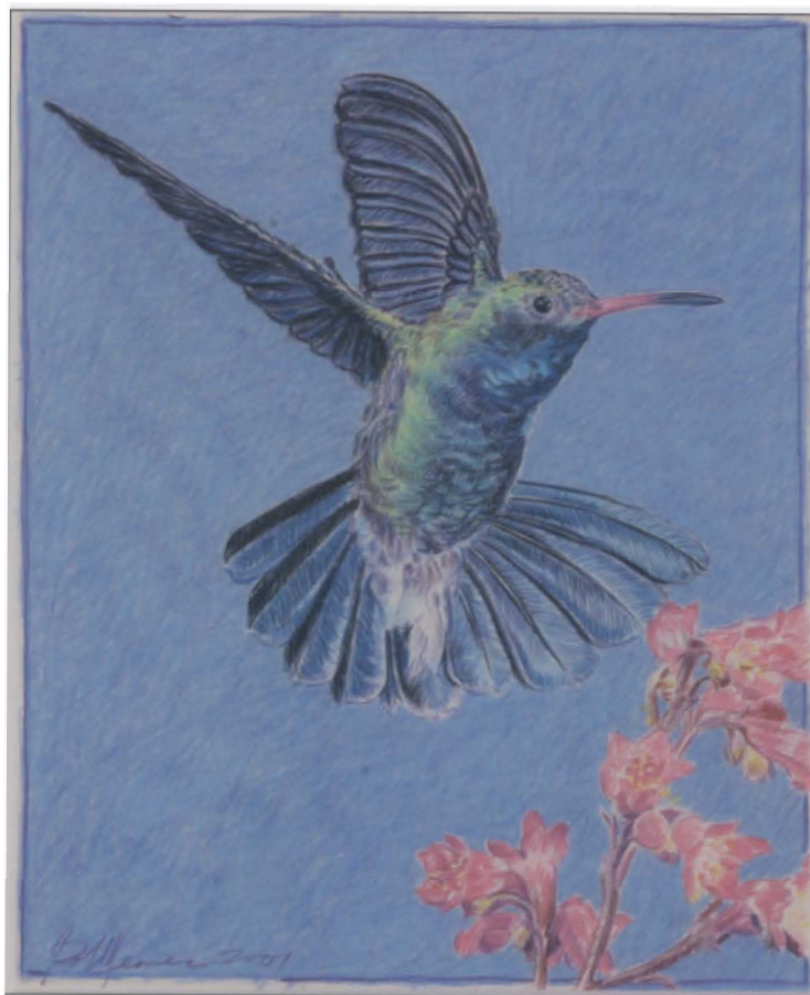
Front Cover Image Detail: Self-Portrait oil on paper, 1986 Museum of Nebraska Art Gift of Lorraine Rohman