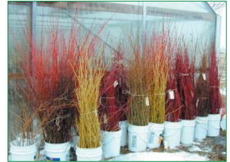
Woody floral stems in storage buckets

The length of time woody floral stems can be viably stored is determined by evaluating stem color intensity, flexibility, tip die-back and shoot and root growth. After several months of stor-