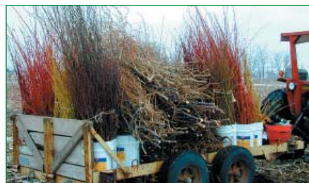
Hauling harvested woody floral stems

Harvested woody floral stems should be stored in clean water or a 10 percent water: bleach solution at 34-40° F. A dark cooler is optimal